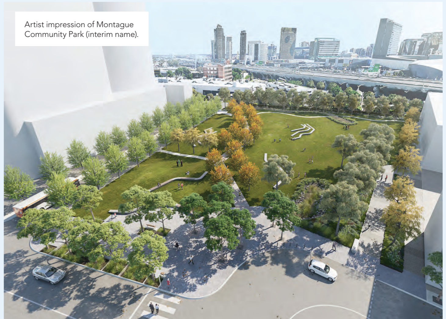
Artist impression of Montague Community Park (interim name).

We've identified an opportunity to transform the northern half of Railway Place into a pedestrian-only area to provide easy access between the school and the new Route 96 tram stop. Read on to find out more about the proposed changes to Railway Place and opportunities to provide feedback.