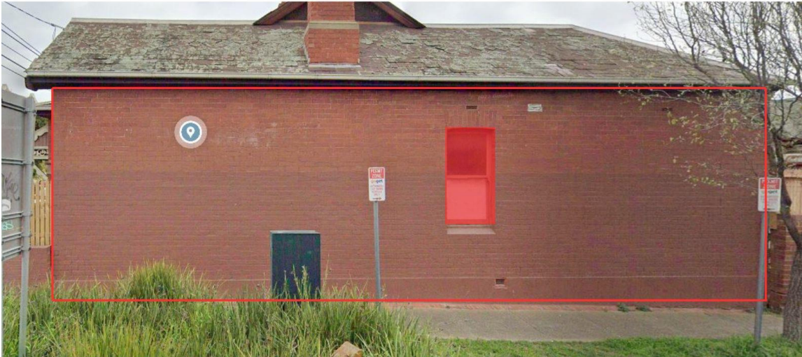
Image: Wall to be painted outlined in red

Work on the site location will need to be completed during business hours. It is the applicant's duty to maintain a safe working environment and immediately report to the City of Port Phillip any issues that may arise on site.