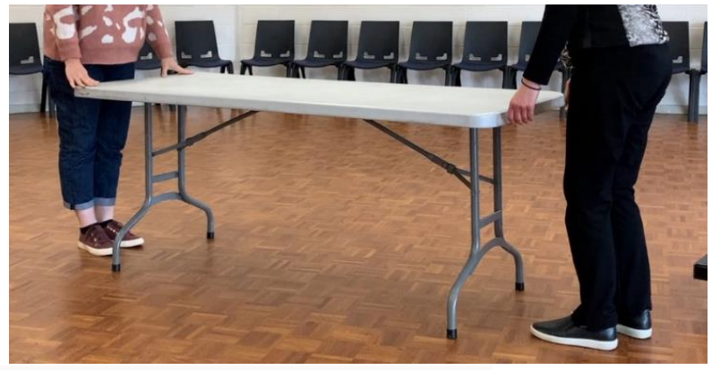
5. Position table where needed