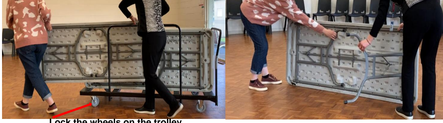
Lock the wheels on the trolley

1. Source a team member to assist with setup Remove table from the trolley