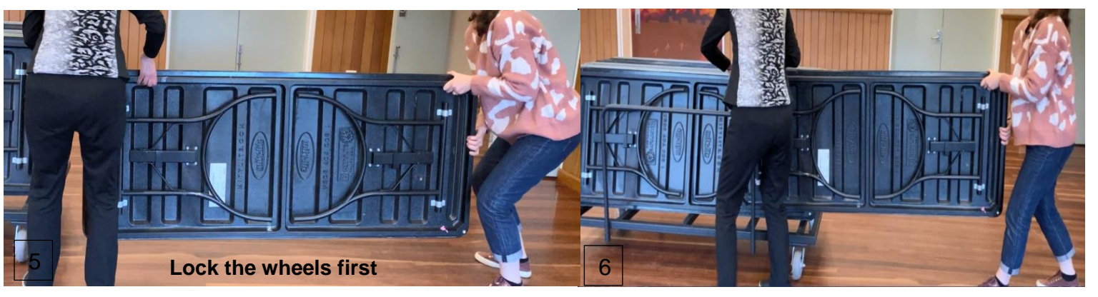
5. Lift the table up to put to the trolley