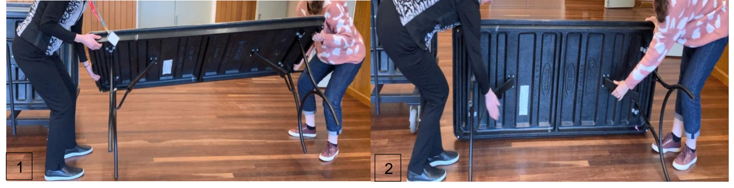
1. Tilt the table on the floor