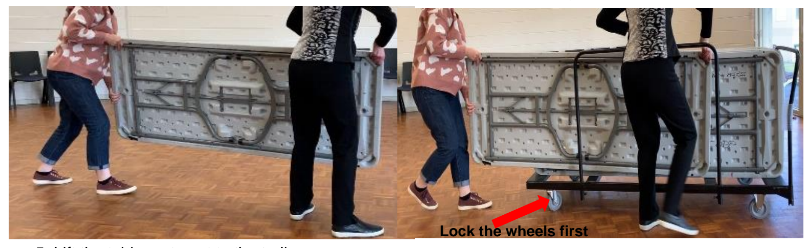
4. Close the legs and lock in the table

5. Lift the table up to put to the trolley