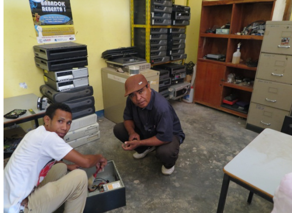
From City of Port Phillip to CCC social enterprise where the second hand computers will be refurbished and available to Covalima community