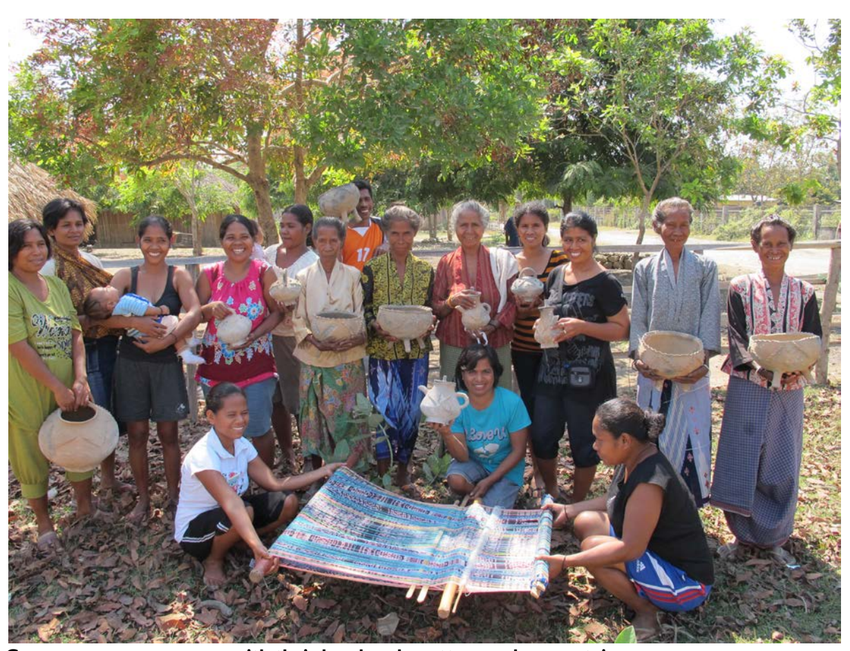
Camanasa womens group with their handmade pottery and woven tais

With IWDA's support, CCC are fulfilling their objectives in empowering women economically, supporting them to take on leadership roles in the community, and encouraging a shift in gender relations in the household and the community. CCC has also succeeded in fulfilling their objective in becoming a 'bridge for development', successfully linking the groups with Government and NGO actors and supporting women experiencing violence to access support,