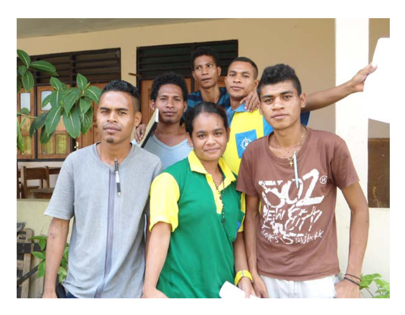
FoS/C building construction scholarship trainees at Vocational Centre in Salele, Covalima

During the 2014 - 15 year, a further 12 young people were supported in vocational training: 3 students at the Canossian Vocational Training Centre in Suai, 6 at the Claretian Training Centre in Salele, Covalima and 3 students at the primary teacher training centre in Baucau. In addition to teaching, fields of study included plumbing, carpentry, masonry, electricity, hospitality and administration.