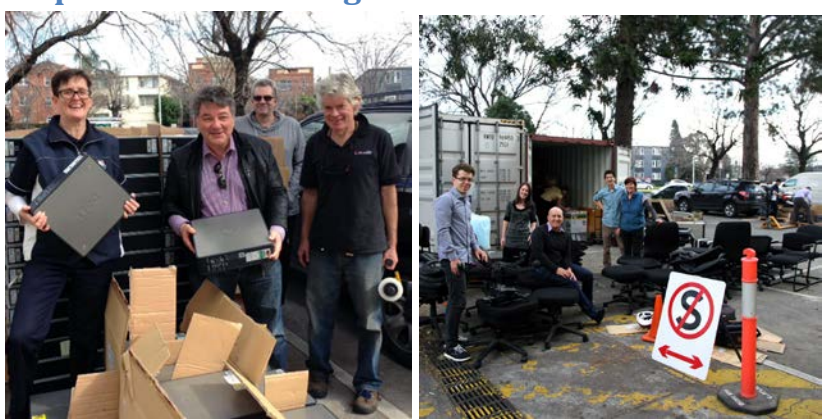
Everyone pitched in to load the container at CoPP with computers and other items bound for Suai

The City of Port Phillip donated approximately 114 recycled computers and screens which were shipped in August 2014, together with second-hand furniture and donated sports uniforms, health kits and art equipment for kindergartens. This was organised with volunteer labour to pack the container with the assistance of City of Port Phillip staff members from across Council.