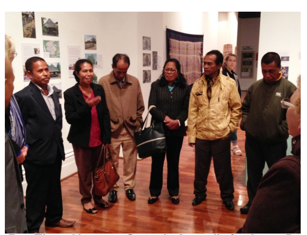
East Timor Veterans Group in Australia for Anzac Day 2015