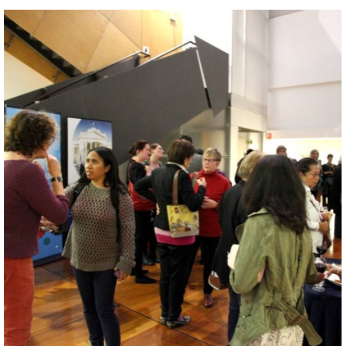
At the launch of the Know our World Exhibition