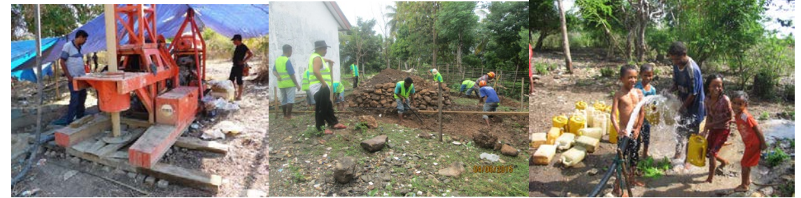
Drilling the bore, foundations for the elevated tank and the first water from the bore