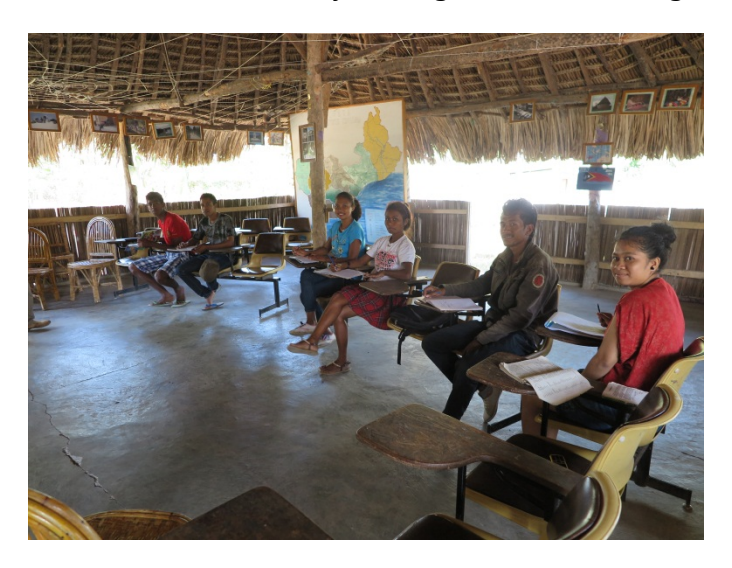
Pre Intermediate English Language Students at CCC

English training continues to be popular at the CCC. The CCC English tutors provided courses for 706 students (442 female and 264 male) at Basic, Pre-Intermediate and Intermediate levels, with 401 students achieving certificates. CCC also assisted with English classes conducted elsewhere in Covalima by lending books, monitoring and providing certificates.