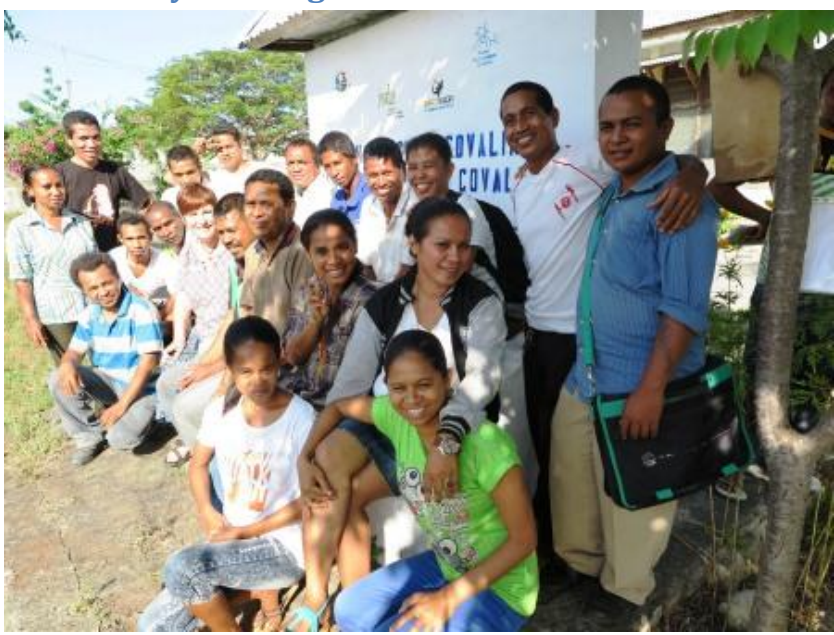
Strengthening Capacity at the CCC: CCC Staff and Volunteers 12 gain cert 3 in Workplace Training and Assessment. Two additional staff gained certificate 4, all supported by FoS/C

English training continues to be popular at the CCC. The CCC English tutors provided courses for 706 students (442 female and 264 male) at Basic, Pre-Intermediate and Intermediate levels, with 401 students achieving certificates. CCC also assisted with English classes conducted elsewhere in Covalima by lending books, monitoring and providing certificates.