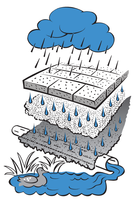
Porous paving will allow for drainage in urban areas.

Porous paving is installed in the same way as traditional paving and is available in many forms. They can be used to replace asphalt, concrete or other impervious pavers.