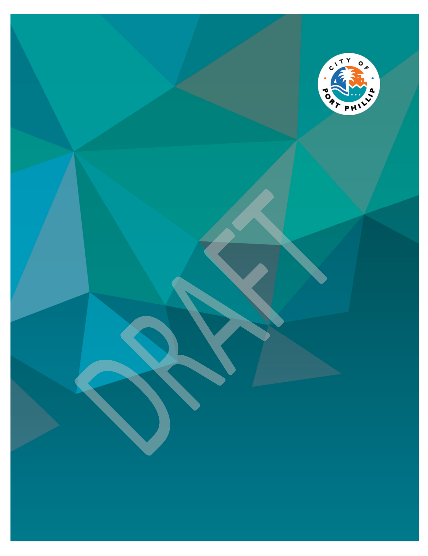
Attachment 1: Community Grants Assessment Panel Reference Committee Terms of Reference 2023-25