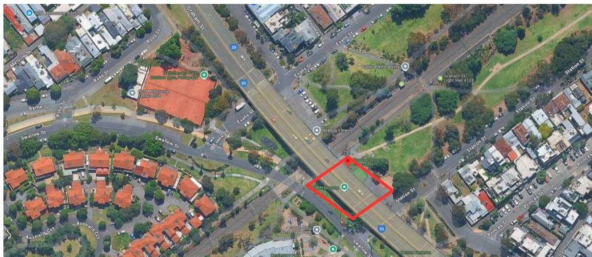
Image: Birdseye view of the skatepark under graham street overpass – skatepark indicated in Red

The proposed new artwork will be delivered with minimal impact to the current function of the road and footpath. No native vegetation or fauna will be impacted as the proposal takes place on a wide concrete footpath.