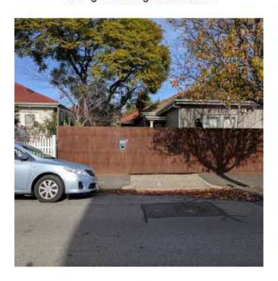
Looking towards 27 Blanche Street