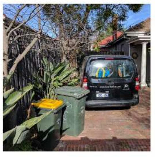
Looking along the Road within the occupation of 27 Blanche Street