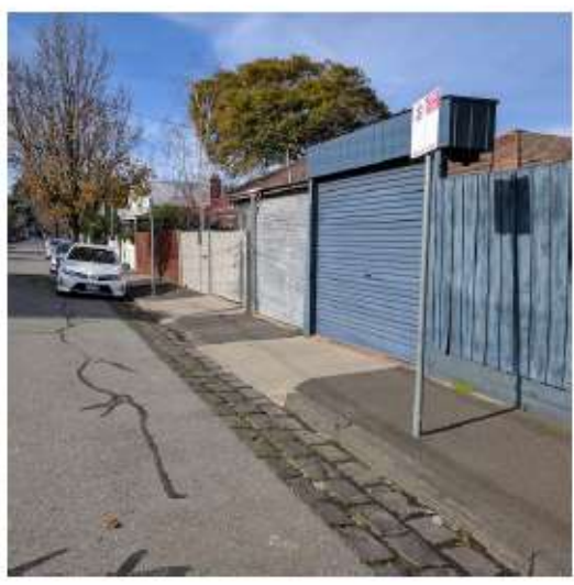
Looking east along Blanche Street