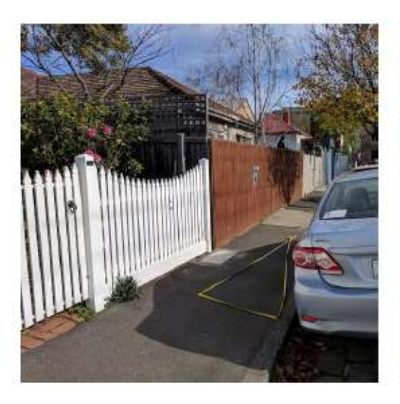
Looking west along Blanche Street