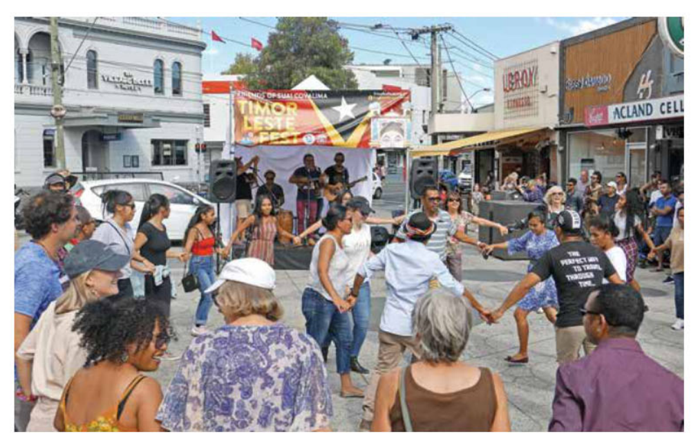
The crowd joining in the dancing at the Timor Leste festival in Acland Plaza.

Hundreds of people attended the festival and there was a wonderful atmosphere. It was great to see many new and old friends gathering together to enjoy the entertainment and to celebrate the friendship.