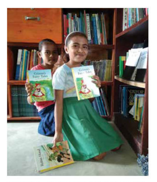
English language students at CCC reading books in the CCC library.

The workshop was held on 15-16 April, with 58 participants from pre-secondary and secondary schools throughout the district. The objective was to develop skills to implement practical activities to use alongside theory in the classroom. Trainers, teachers and students shared ideas to create fun learning experiences, often using everyday objects. The feedback from all who participated was that the workshops were extremely beneficial. FoSC will continue to provide support for initiatives from this enthusiastic group of local teachers.