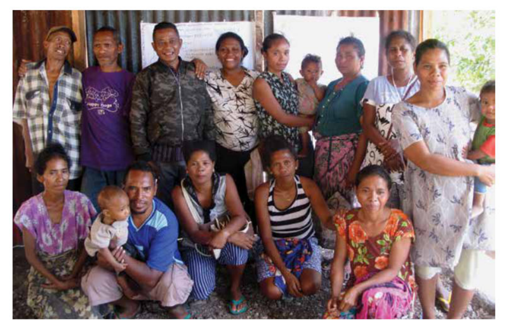
Communities receiving training for disaster risk reduction.

The network includes 12 member organisations, who meet quarterly and involve local government ministries and services in their meetings and training.