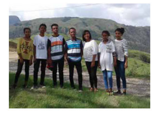
Students travelling to Maliana to sit entry tests.

Scholarships are funded through FoSC fundraising activities and community donations, and the application and