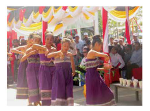
A traditional dance performance at the highway inauguration.