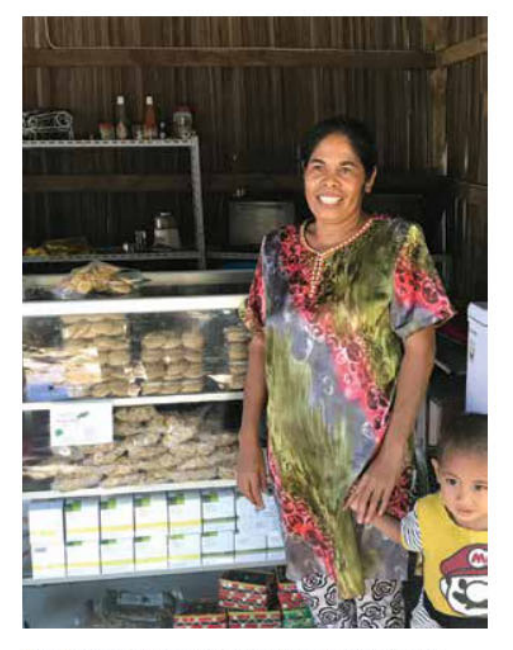
The Remajeleju group, established through the RWDP, have a very successful shop in Suai.

of women in leadership and the workplace, and the role of men in the home.