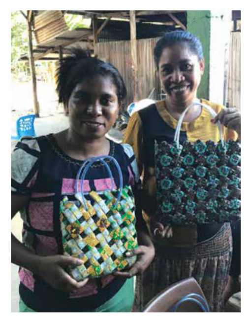
RWDP staff with bags produced by local women.

A key focus area for the CCC is to contribute to the empowerment of women; this includes support for economic activities and the encouragement of women's leadership and participation in political and civil life. It is recognised that the concept of gender equality challenges culture and tradition, and CCC staff are working hard to shift attitudes on the role