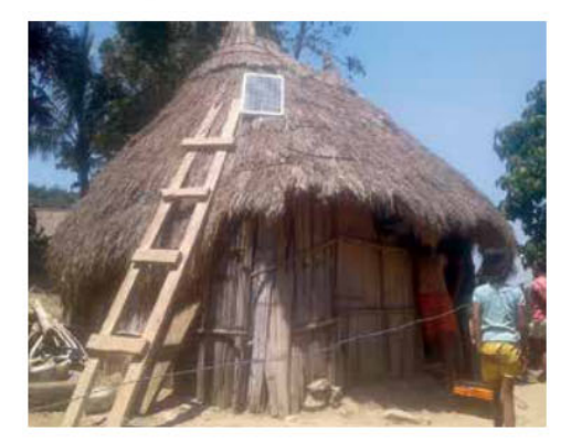
Solar installation in Halik Nai.

The CCC staff have played a key role in community consultation before and after