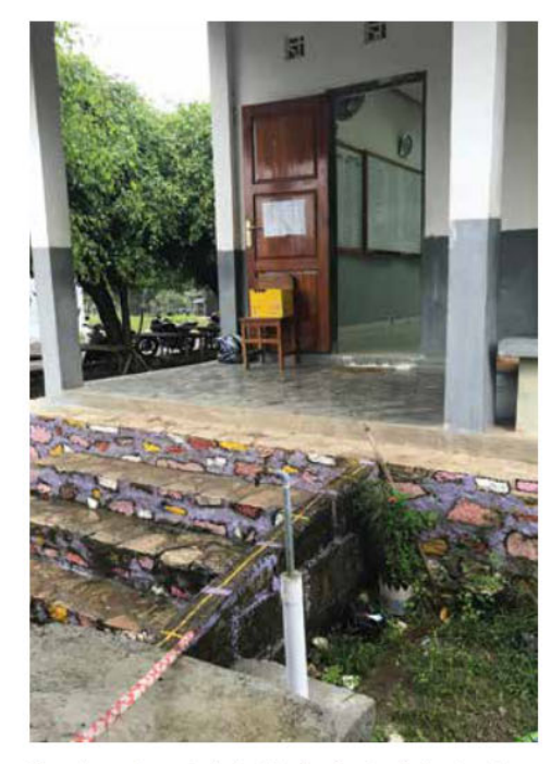
Taps have been installed in the front of all school buildings.

A new WASH Committee consisting of six teachers, one representative from the Parents Association and two community