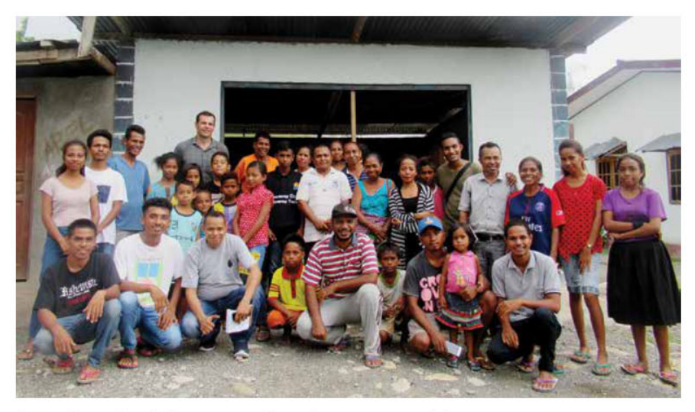
Community members in Ogues at a meeting to discuss computer training.

One scholarship recipient, studying at Marista Teachers College in Baucau, graduated in 2018 and is now working as a teacher at the local vocational training centre in Suai, and teaching current scholarship recipients in the hospitality and administration courses. Another graduate commenced work this year for the national organisation for people with disabilities, RHTO. Based in Suai, his role involves working in communities to encourage disability inclusion and also to share inforamtion on disaster risk reduction.