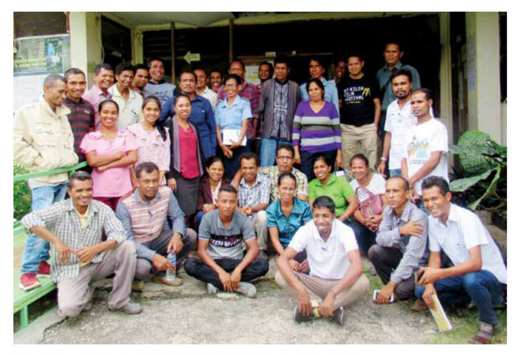
Commission members, staff and volunteers at the Covalima Community Centre.