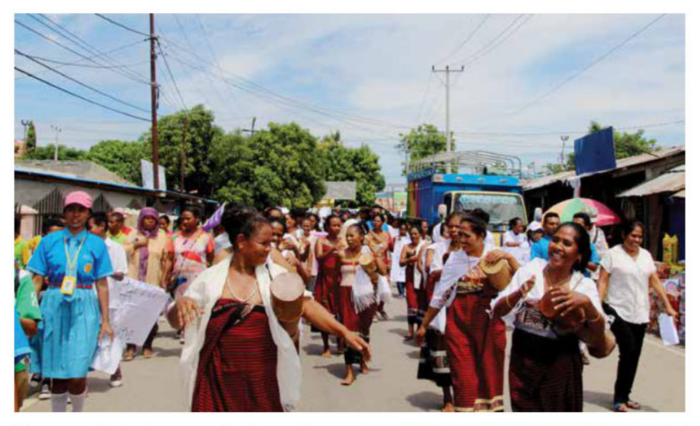
Women parading in the streets calling for equality.

(RHTO) to CCC staff. The training provided staff with a better understanding of how to work inclusively with people with disability, and to build disability awareness.