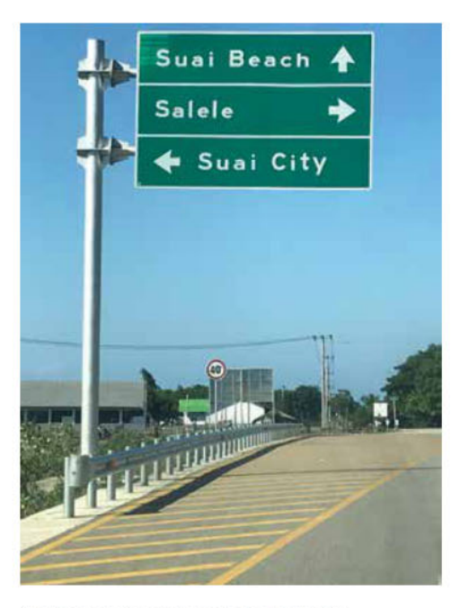
Signage on the open stretch of highway.

last 12 months. It has been announced that exploration will commence in the coming year however there is a lack of information on where this will occur and the impact on communities. The Rede Covalima Network is also monitoring this closely