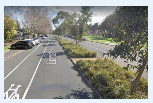
Liardet Street, Port Melbourne, in September 2022

We are now looking at opportunities to include nature strips across the municipality. For example, during footpath renewal works, residents will be asked if they would prefer a nature strip to be created rather than resurfacing the entire footpath area with asphalt. Eastern Road, South Melbourne, was identified as one of these sites and most residents supported the change, resulting in new gardens in this area.