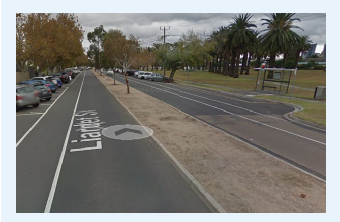
Liardet Street, Port Melbourne, in November 2017

In Liardet Street, Port Melbourne, we have re-engineered sections of the centre median. We also excavated road base material to create deep root planting zones for large new canopy trees. The new deep-root planting zones provide street trees with access to water and essential nutrients creating ideal conditions for healthy structural roots. The project has been hugely successful and the new trees are thriving.