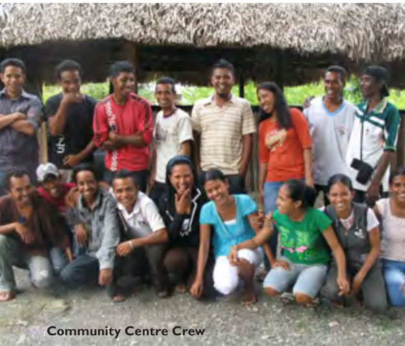
Community Centre Crew

The iconic unfinished church is changing shape too. The three-pointed façade has gone and some of the locals are not happy about that. It is being built with local donations and church money and other funds and will become the main church in the town. The Ava Maria Church rebuilt in 2010 cannot accommodate the hundreds of churchgoers overflowing into the grounds each Sunday to take communion.