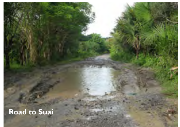
Road to Suai

Little is known about the infrastructural projects in the town as information that exists is contradictory. The consultation processes has only involved Chefe de Sucos but there still appears to have been no consultation (by them or the government) within the communities whose land is likely to be affected. The District Administration report that 300 Koreans are due to arrive in Timor for geological survey work this year, but how they will be housed and fed is not known.