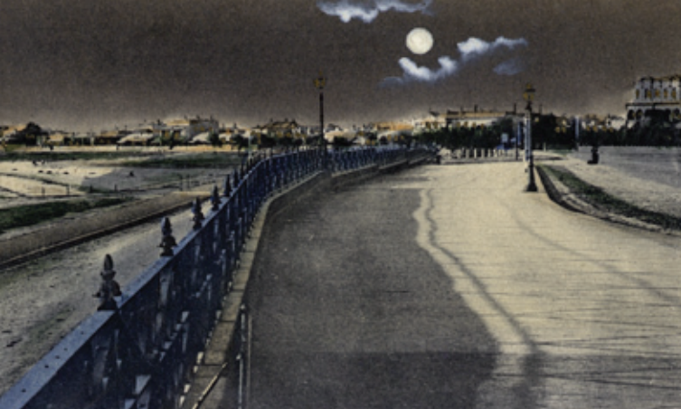
West Beach at night, St Kilda, early 1900s, sk0803