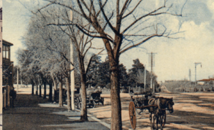
Park St and St Kilda Rd, early 1900s, sm0339