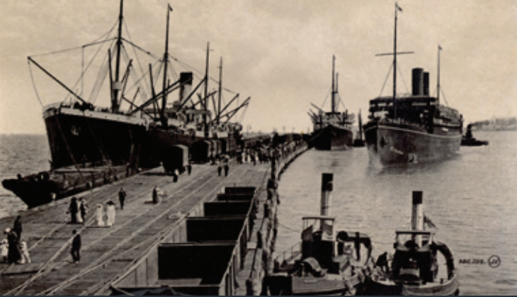
Liners at Port Melbourne pier, early 1900s pm1972