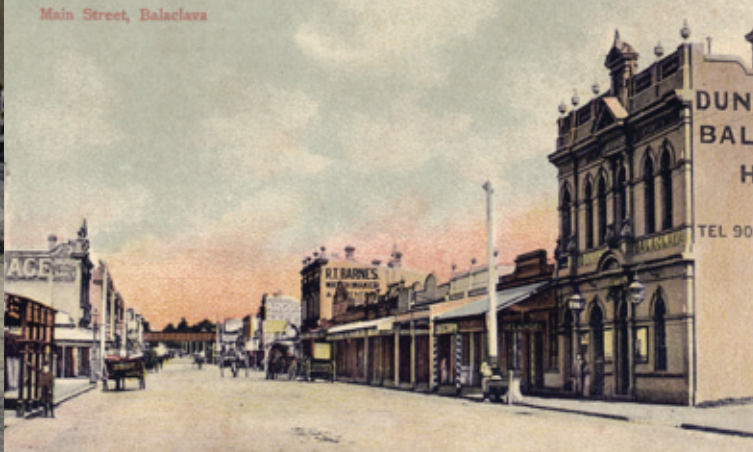
Main Street, Balaclava, 1890s, sk0812.1-2