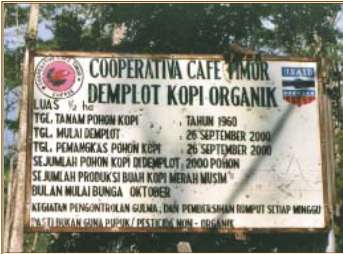
Organic Coffee Demonstration Plot

The coffee-producing country of East Timor comprises the eastern half of the island of Timor at the far end of the Indonesian archipelago, situated between the Banda and Timor Seas. Physically closer to Australia than Indonesia, the island is thought to have been a gateway for the early settlers of Australia. East Timor's largest ethnic group is the Mambai, whose ancestors are believed to have settled there more than 5000 years ago.