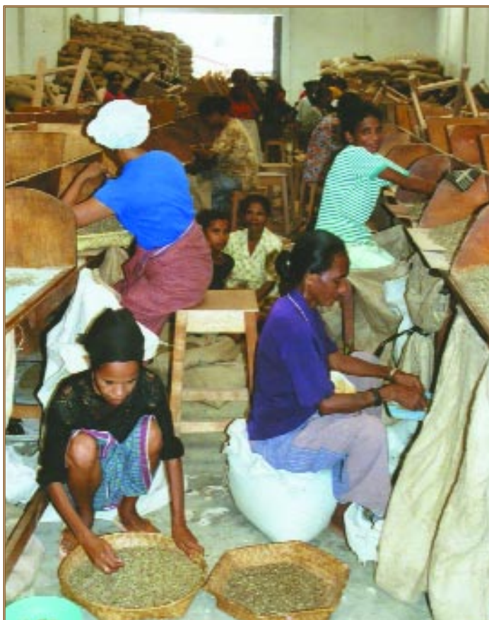
Hand-sorting CCT coffee in Dili

hand-sorters, women of all ages chatter away while skillfully sorting around 90 kilos of coffee per person, per day. This step in quality assurance allows CCT to claim “zero-defects” on all coffee it exports.