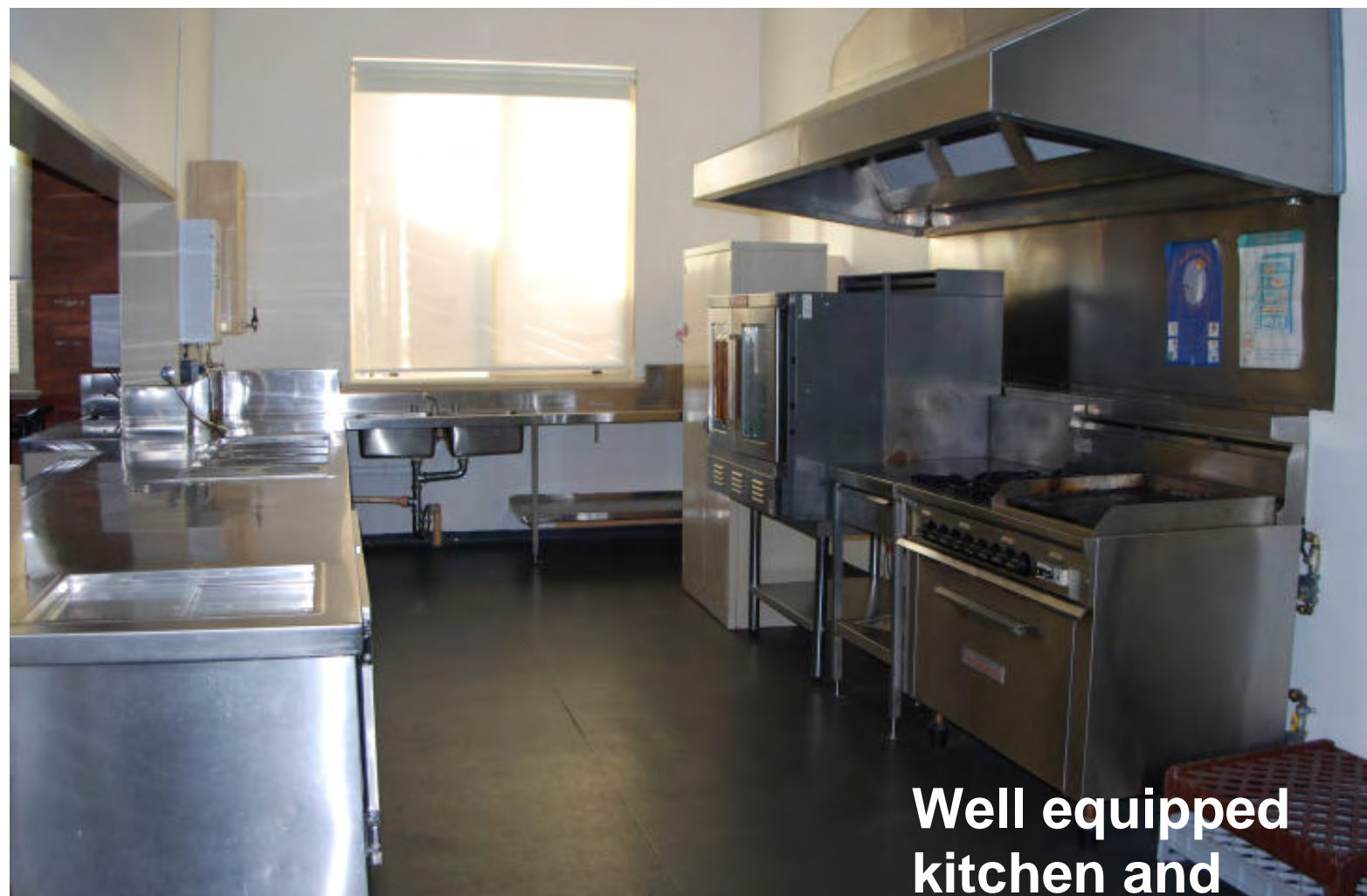
Well equipped kitchen and dining area