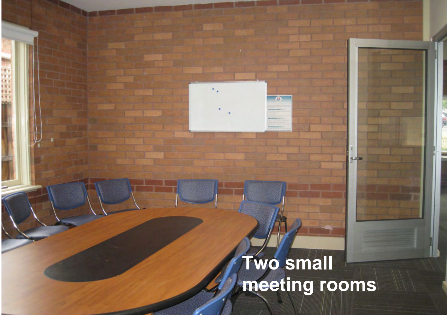
Two small meeting rooms