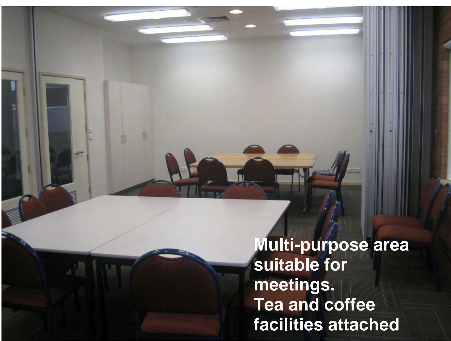
Multi-purpose area suitable for meetings. Tea and coffee facilities attached