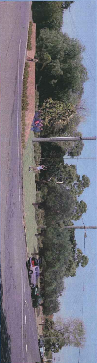
View 1 Looking south-west down Evans Street after works.