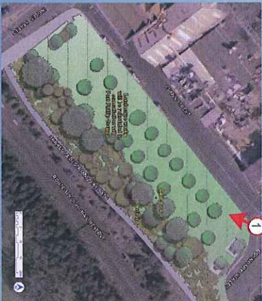
Fennell Reserve Shaft Site plan after works.