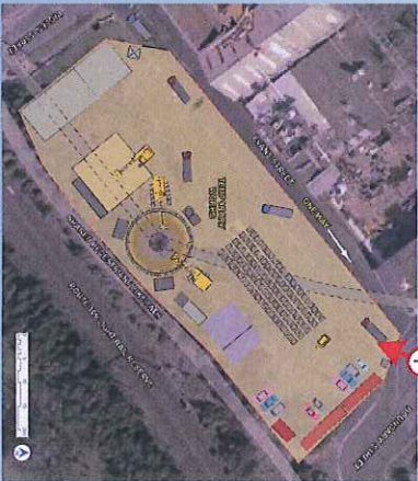
Fennell Reserve Shaft Site plan during works.