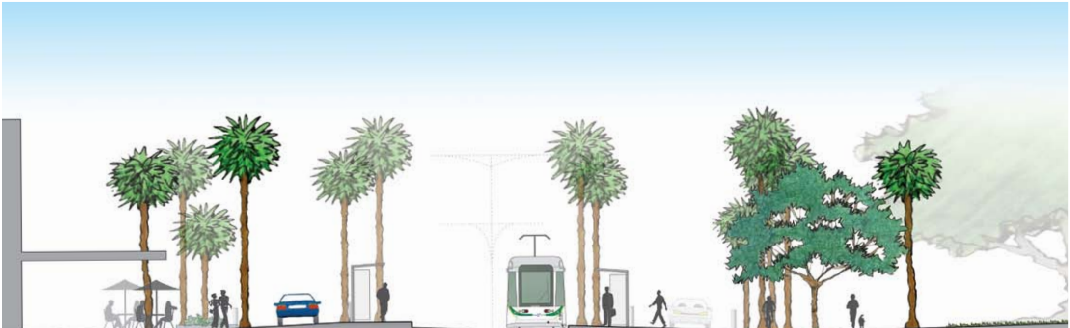
Cross Section: Existing restaurants & outdoor dining, landscaping and design of the renewed tram stop, through to Cleve Gardens.