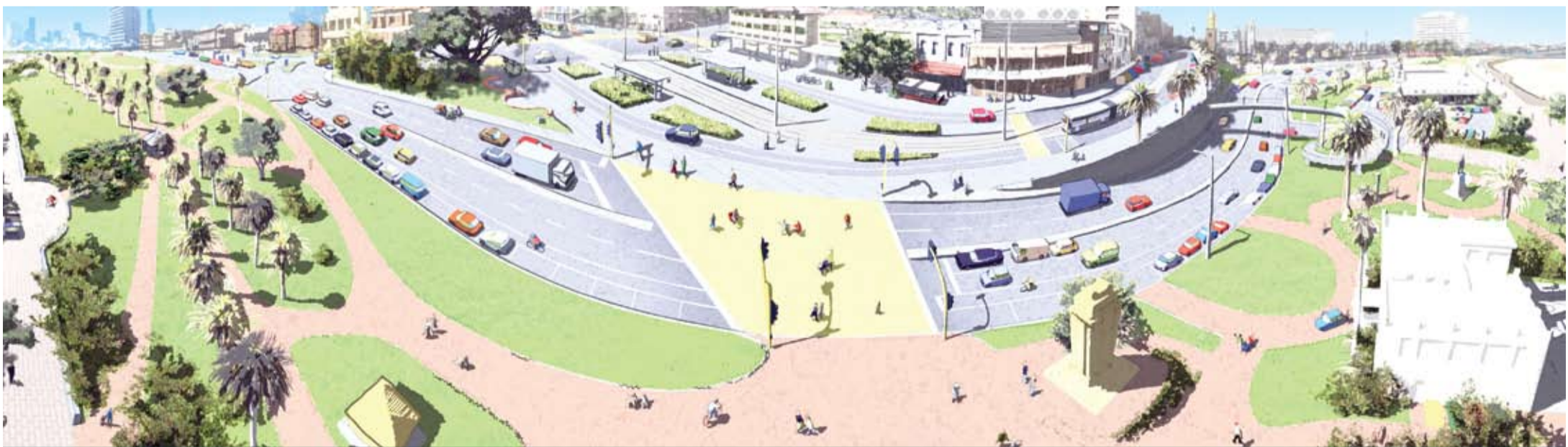
ILLUSTRATION CONCEPT ONLY

Link to website www.portphilip.vic.gov.au/stkildas_edge Email contact ske@portphilip.vic.gov.au Phone ASSIT 9209 6777