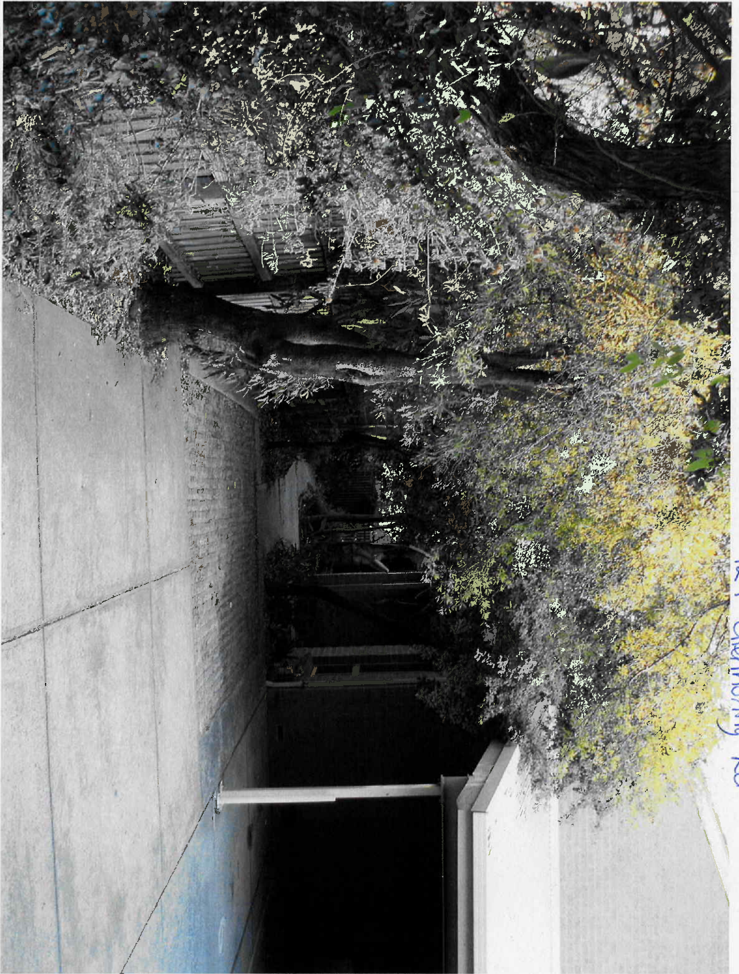
129 Glenhurst Rd