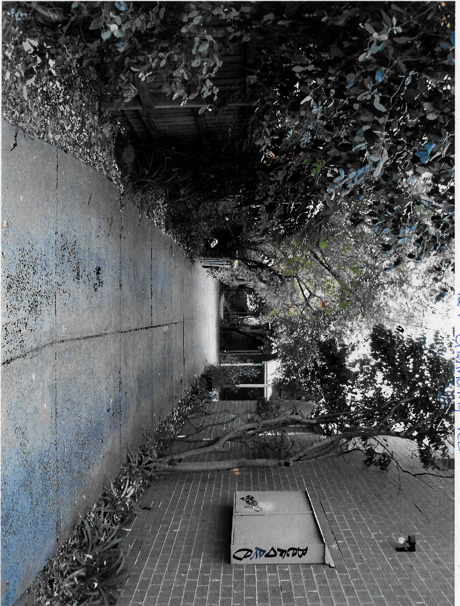
129 Clenhardt Rd