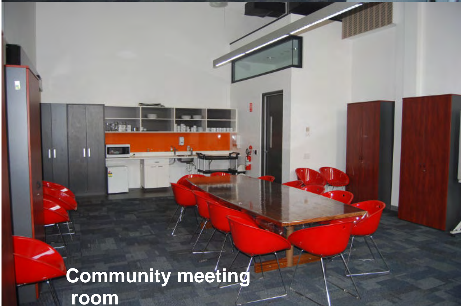
Community meeting room