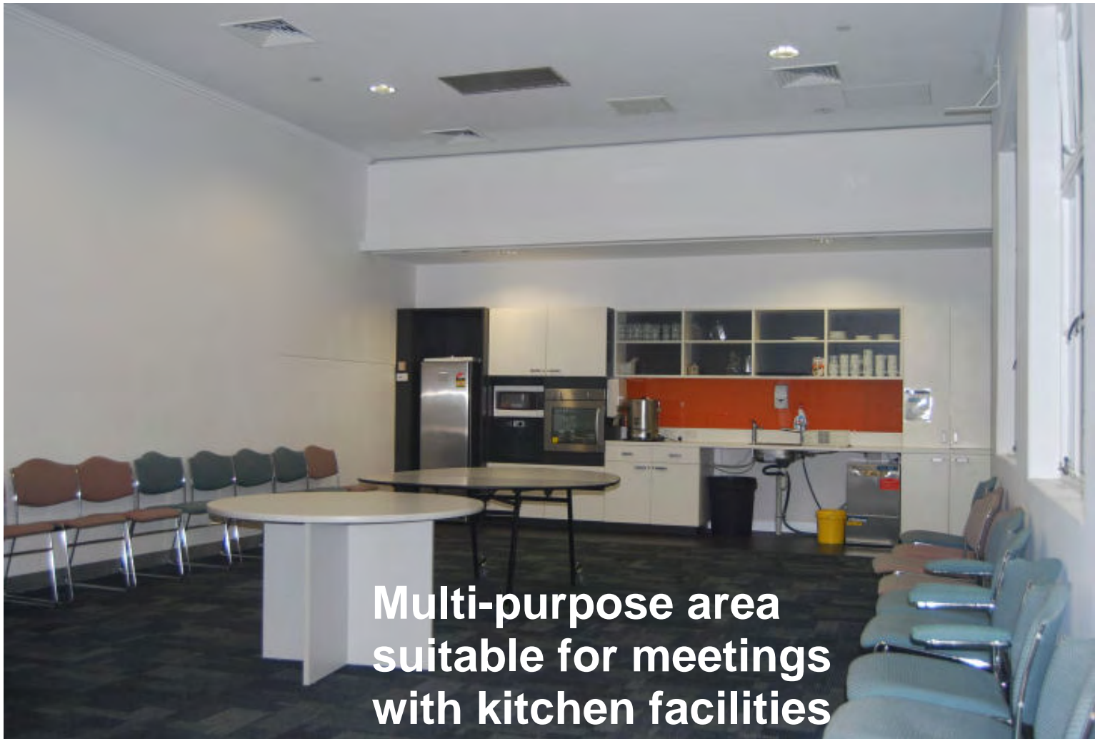
Multi-purpose area suitable for meetings with kitchen facilities