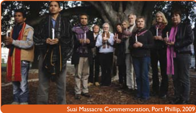
Suai Massacre Commemoration, Port Phillip, 2009

Ten years ago we started Truckloads for Timor and sent rice, clothing, bikes and other urgently-needed aid to Suai in a ute. That ute has just been retired so we're pleased to announce we're donating an ex-fleet Toyota Hi Lux utility filled with library books and school packs and flat screen monitors for the Suai Community Centre early next month as part of the celebrations. Most initiatives over the past ten years have been in the form of targeted small-scale