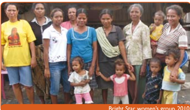
Bright Star women's group, 2010