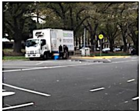
Common occurrence of vehicles parking in no standing zones to Albert Road Reserve side involving unsafe transfer of goods across roadway.