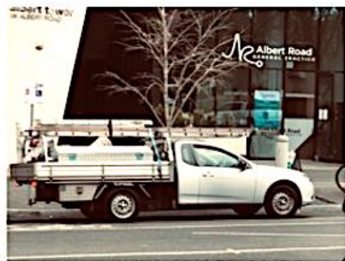
Frequent parking of vehicles on footpath impeding pedestrians and sight lines of vehicles exiting from basement carparks. Common use of DDA parking bays for loading.