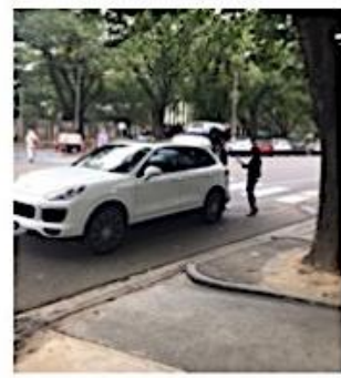
Frequent kerbside parking and drop-offs in close proximity or over mid-block pedestrian crossing impeding pedestrians and safe sight lines of pedestrian movements.