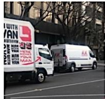
Parking in Keep Clear and No Standing zones.