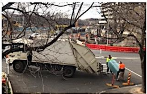
Deliveries and pickups involving blocking of Keep Clear zone, driveways to buildings and impeding of cyclists.