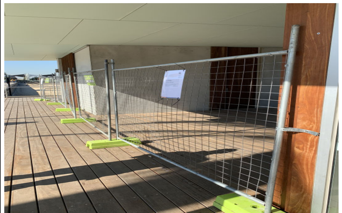
Stage One fencing with Works Notification letters

*Please note: answers to any questions during Councillor Question Time which were answered at the meeting are included in the minutes of that meeting.