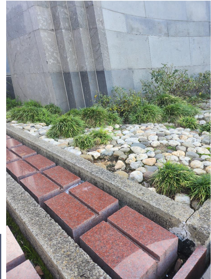
Integrated plants, water and built form at St Kilda Library

Some narrow streets don't have enough space on the verge for a tree. One potential solution is to de-pave and add an in-road tree planting. This works well in spaces with room for 'one and a bit' cars, and does not necessarily remove a car park.