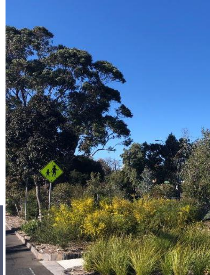
Danks Biolink.

In the median of Danks Street, lawn has been replaced with a diverse understorey, with indigenous plants, nesting boxes and bird baths to support local bird species, as part of a larger Biolink project. Valued by human and feathered friends alike, local schools are now using the space for environmental education, in partnership with Council.