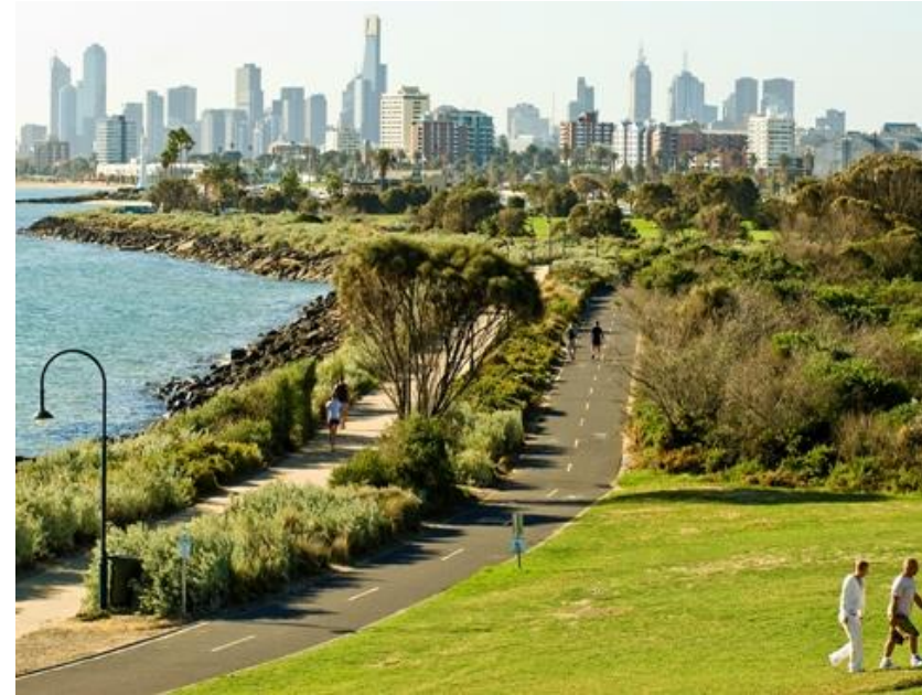
Elwood Foreshore

In our urban forest, quality is just as important as quantity. Integrated design considers the plant’s needs, the needs of other adjacent uses, environmental factors, and the local character. Construction and maintenance considerations include plant selection, site preparation, proper planting techniques, establishment and young tree care, regular inspections, risk management, pest treatments, and ongoing care.