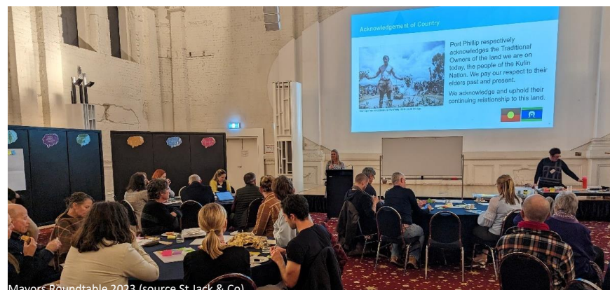
Mayors Roundtable 2023.

We look forward to working with you, and all our community, over the rest of the year as we plan for the future together.