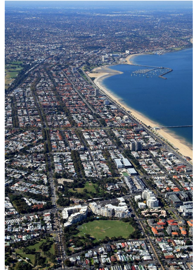
Aerial Image looking South East over Albert Park

All residents and landholders play an important role in greening our neighbourhoods, as do the many local environmental advocates and groups, who partner with Council to care for green spaces for the benefit of the whole community. Together we can grow a greener Port Phillip.