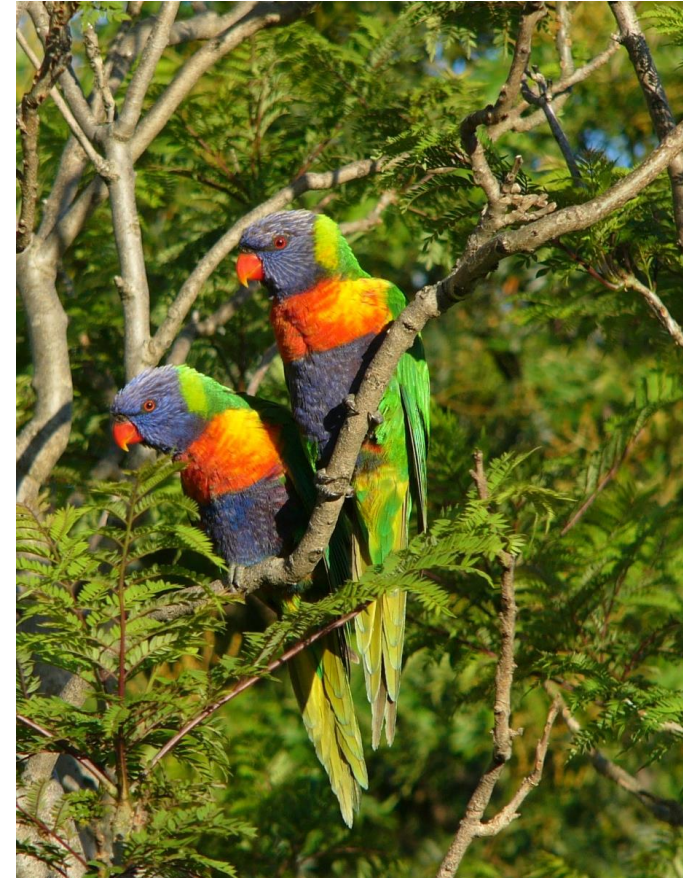
Rainbow Lorikeets

It is now time to build on the success of Greening Port Phillip and develop a new strategy for 2040, for an urban forest that is healthy, biodiverse and connected.