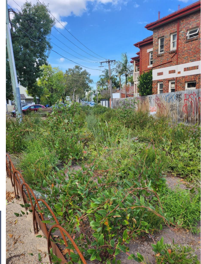
Woody Meadow in Bothwell Biolink

In 2022, works commenced on the Bothwell Biolink. Large patches of grass were replaced with indigenous plantings in a diverse woody meadow. A community planting day in October 2022 encouraged local residents to join in, with signs continuing to raise awareness about the benefits.