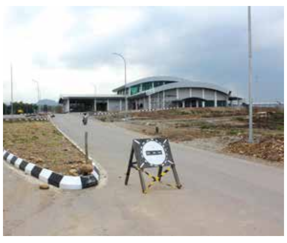
New Suai airport.

The new air service to Dili, which operates 5 days a week to the future 'economic zones' of Covalima and Oecusse is relatively cheap and a major improvement. Road building and upgrading was noticeable everywhere en-route to Covalima, and in and around Suai. Major roads are being repaired. The construction of the new major road from Suai to Viqueque is underway costing $1.5 billion. Many trees have already been removed for road construction and removal of another 1000 trees was planned. There was concern by community members that the health of nearby communities is adversely affected because of dust, and environmental impact concerns were expressed regarding erosion and landslides, leading to damaged drainage and to local flooding with the onset of the wet season. On the other hand, it is acknowledged that the new road will provide better access to and from Covalima.