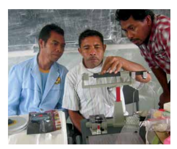
Secondary teacher in-service science training 2016.

In late 2016, senior secondary teachers in Covalima attended in-service training in science and maths. The program, delivered by SESIM hosted at the Suai Secondary School was funded by FoS/C, and supported by the CCC and District Education. There were 28 teachers (15 men and 13 women) from various Covalima schools and 5 trainers. Senior schoolteachers have not had this opportunity previously in biology, maths, chemistry and physics. It was clear that all of the teachers were engaged in interactive learning with a chance for questions and answers. Not even monsoonal rains could stop this workshop with teachers coming from the sub districts.