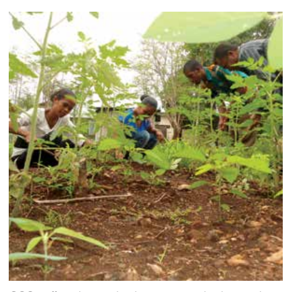
CCC staff working in the demonstration kitchen garden.

By implementing its new strategic plan 2016 – 2020, the CCC is working effectively to achieve its mission to build a community in which "everyone has the opportunity to develop their capacities so that they can contribute to the social and economic development of the District of Covalima."