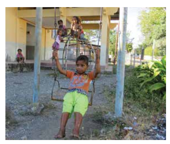
New Fence for the Suai kindergarten thanks to Rotary,

clubs, information sharing and engaging in drama and games with students, can make significant progress and guide students, staff and their families to better health and wellbeing. The CCC Health Promotion Officer continues to promote these goals working with the Suai School.