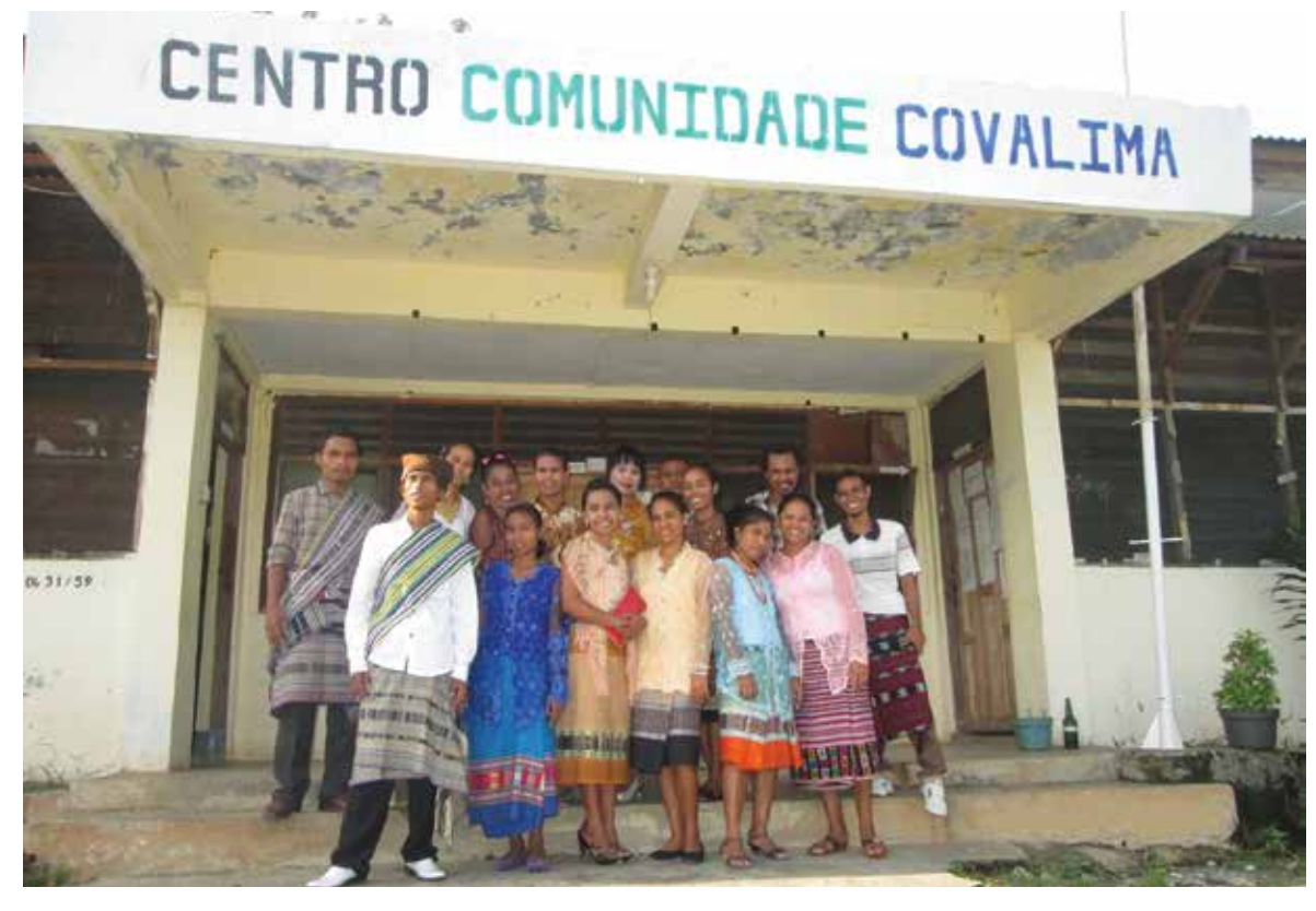
CCC staff attending International Women's Day event.

CCC has become more involved in advocacy on land issues, the new focus area in its strategic plan. The Covalima Network of local NGOs meets in a small office in the CCC, and people are working on local issues, especially in relation to land. For example, a land dispute has been taken to the public defender and the network is providing an advocacy role for the local community.