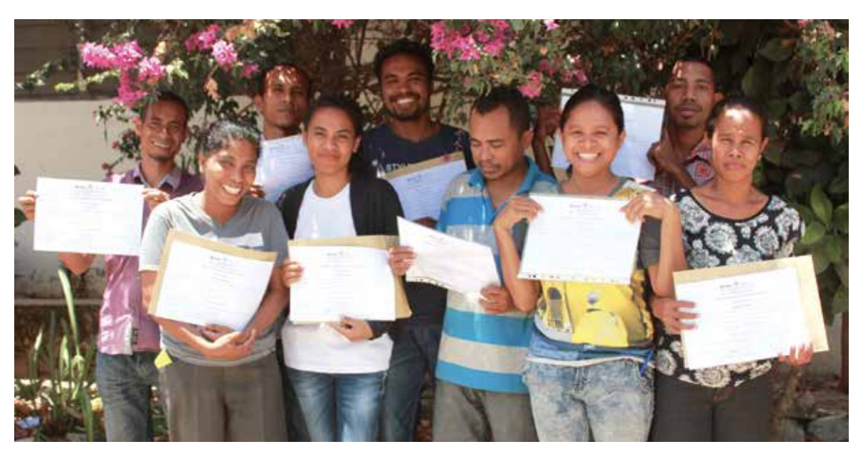
CCC staff training.