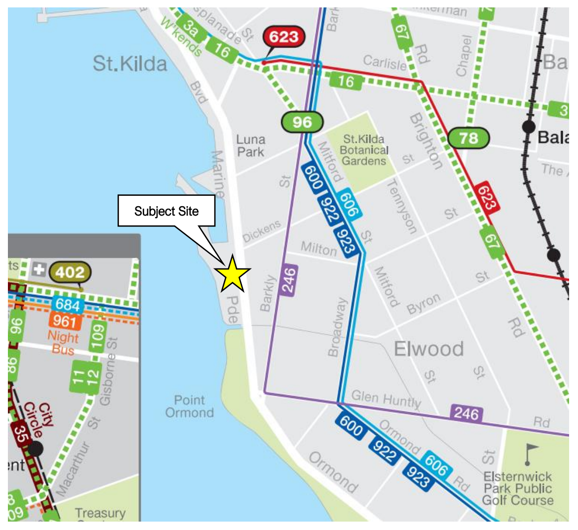
Table 2.2: Public Transport Provision