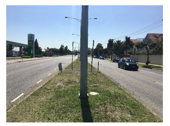
Figure 2.2: Marine Parade looking south (adjacent to site)

Figure 2.1: Marine Parade looking north (adjacent to site)