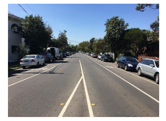
Figure 2.3: Dickens Street looking northeast (adjacent to site)