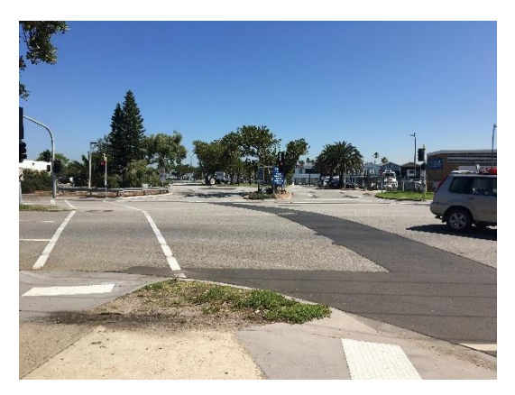
Figure 2.4: Dickens Street looking southwest (adjacent to site)