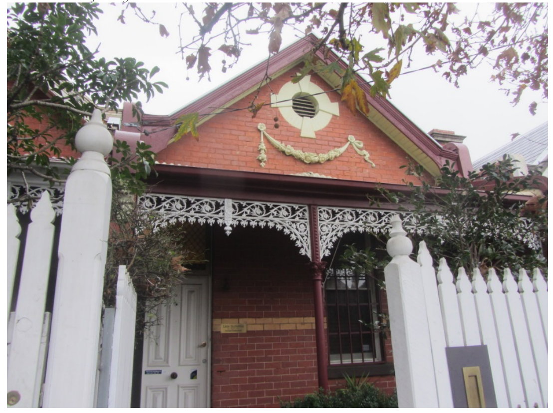
Figure 2. Showing decorative detailing common to 110-112 Barkly Street and 2-6 Blanche Street (oculi and swagged garlands on gable end, verandah posts and cast iron frieze, cream brick banding).