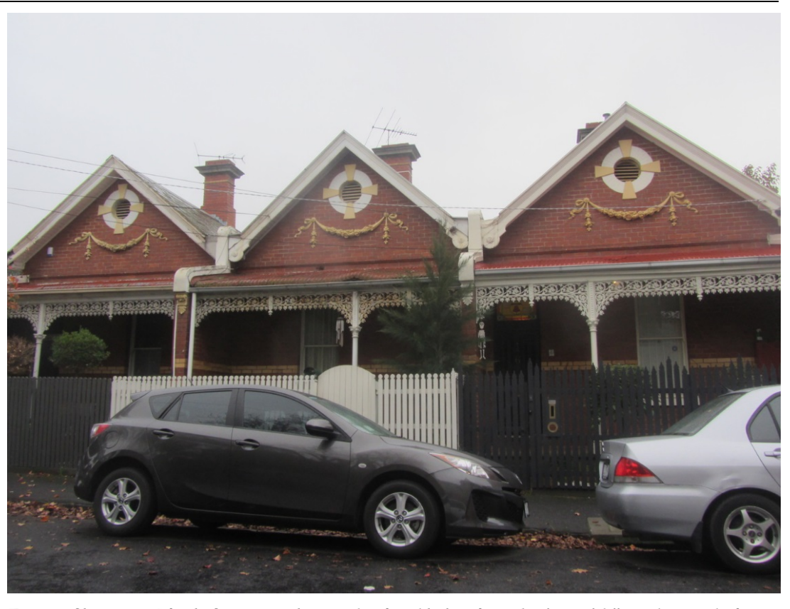
Figure 5. Showing 2-6 Blanche Street - note the painted oculi and high timber picket fences of different design and colours.