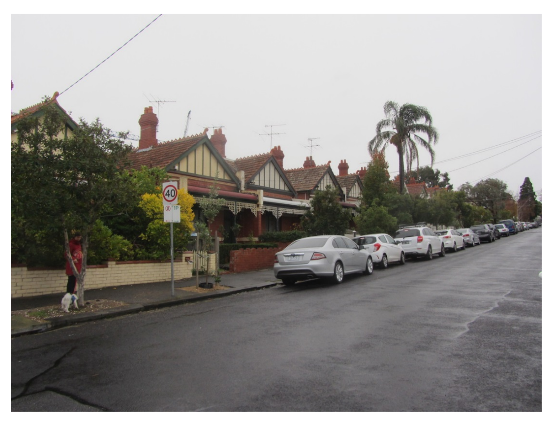
Figure 11. Houses at 10-36 Lambeth Place. Note the high degree of intactness and similarity of design and detailing. This detailing is more typical of the period when compared to that of Barkly and Blanche streets group.

houses. These houses in Lambeth Place were all built c.1909 for the owner Mr Sleep. P Einsiedel is once again recorded as the builder of some of these houses, which are very similar to the Moodie Place cottages.