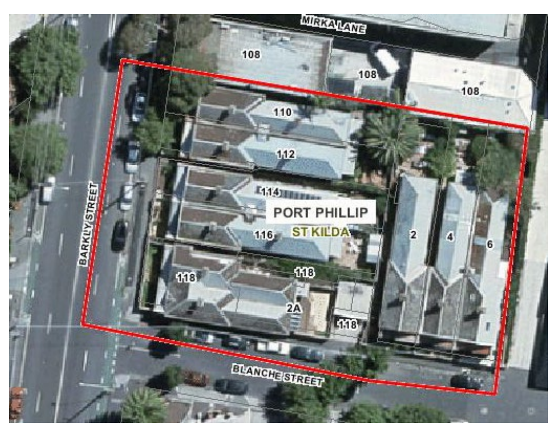
Figure 14 Proposed HO curtilage overlaid on aerial image