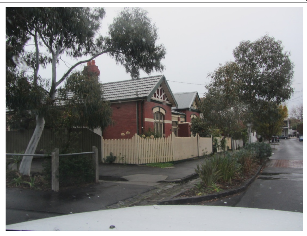
Figure 9. 68-74 Octavia Street, showing two pairs of houses (constructed along with several pairs and one freestanding house in adjacent Moodie Place [around the corner]).