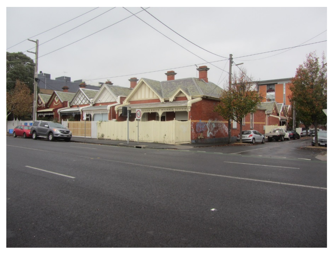
Figure 1. Houses at 110-118 Barkly Street and 2-6 Blanche Street, St Kilda. Note that 118 Barkly is the freestanding villa on the corner of Barkly and Blanche streets.