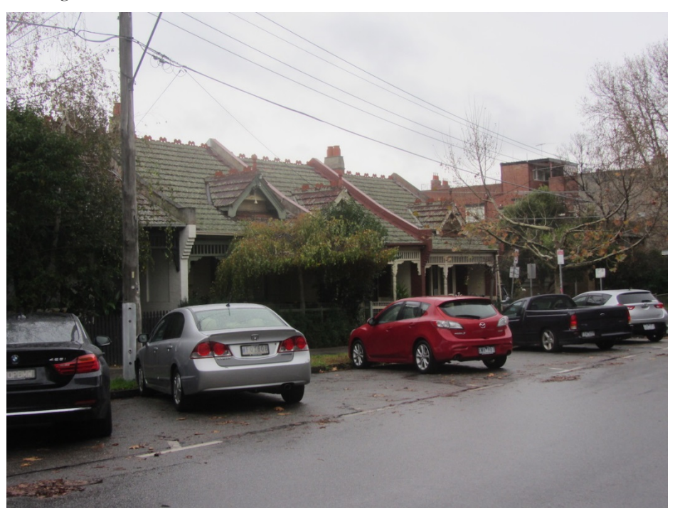
Figure 7. Single terrace row of Edwardian houses c.1910 at 30-44 Acland Street, St Kilda, and located in the St Kilda Hill Precinct (HO5). Note the traditional forms and detailing.

While there are similar examples of groups of Federation/Edwardian houses constructed by a single builder in St Kilda within the St Kilda Hill precinct (HO5), such as those at 30-44 Acland Street (see figure 7), 3-9 and 4-12 Emilton Street (see figure 8), they are all of a much more conventional Federation/Edwardian design idiom, with terra cotta tile roofs with cresting.