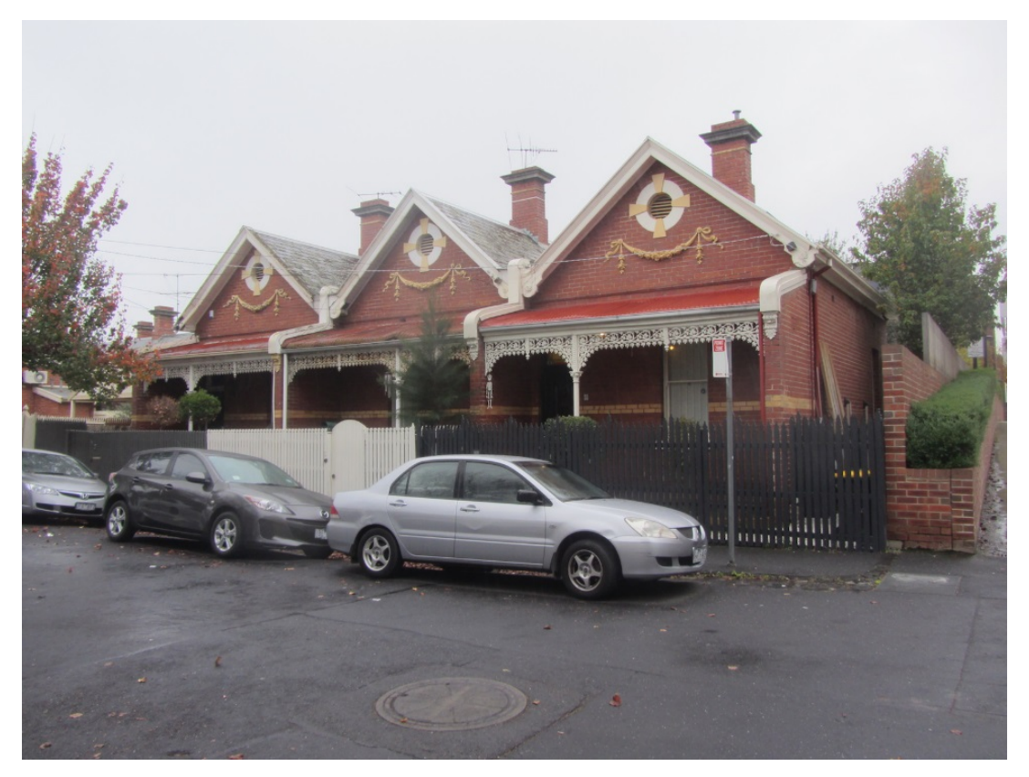
Figure 4. 2-6 Blanche Street showing the identical form and detailing of this conjoined group of three houses, and the high degree of intactness.