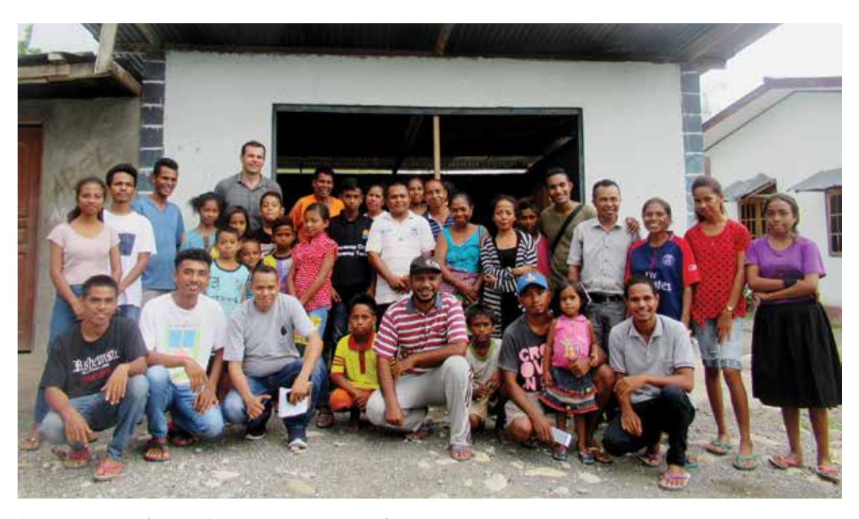
Community members in Ogues at a meeting to discuss computer training.

One scholarship recipient, studying at Marista Teachers College in Baucau, graduated in 2018 and is now working as a teacher at the local vocational training centre in Suai, and teaching current scholarship recipients in the hospitality and administration courses. Another graduate commenced work this year for the national organisation for people with disabilities, RHTO. Based in Suai, his role involves working in communities to encourage disability inclusion and also to share inforamtion on disaster risk reduction.