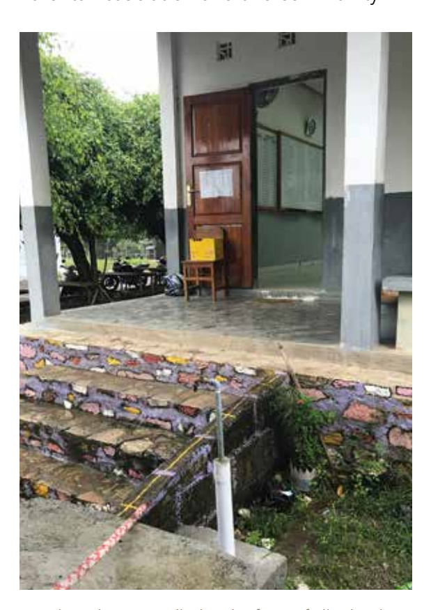
Taps have been installed in the front of all school buildings.

A new WASH Committee consisting of six teachers, one representative from the Parents Association and two community