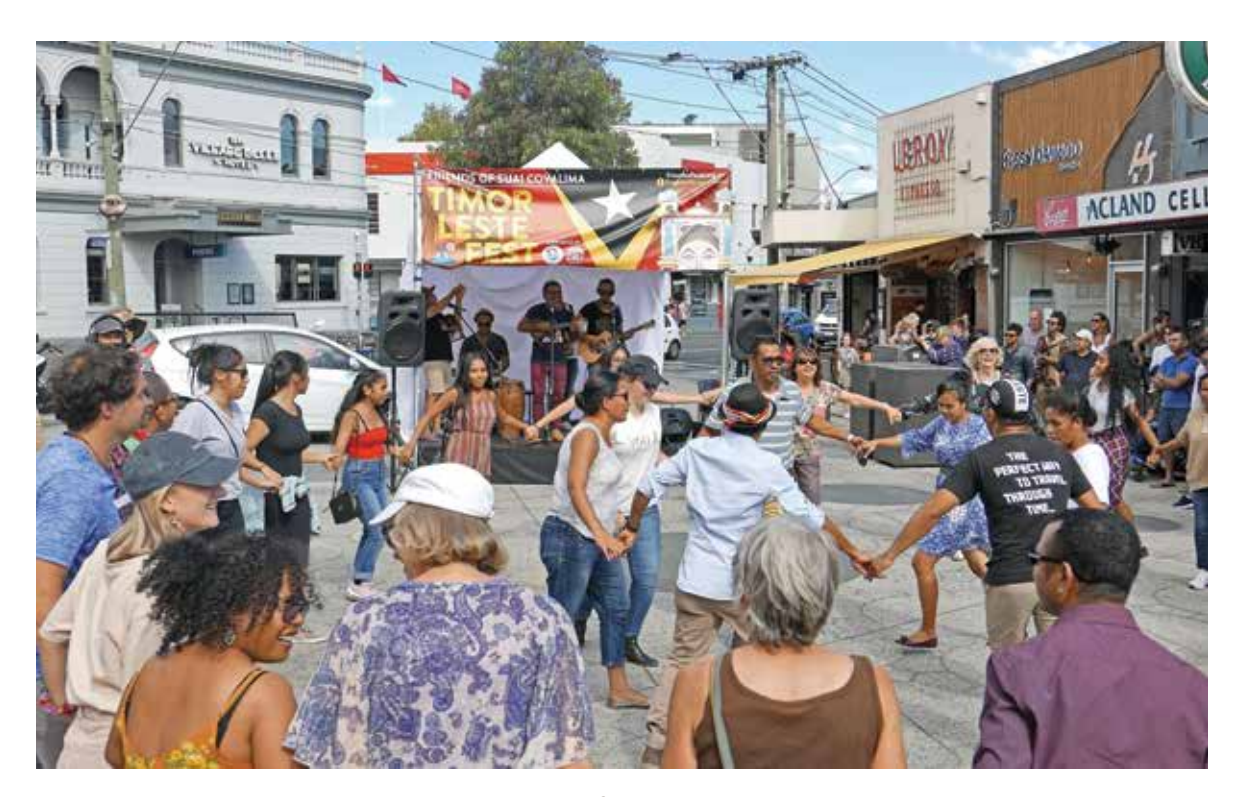
The crowd joining in the dancing at the Timor Leste festival in Acland Plaza.

Hundreds of people attended the festival and there was a wonderful atmosphere. It was great to see many new and old friends gathering together to enjoy the entertainment and to celebrate the friendship.