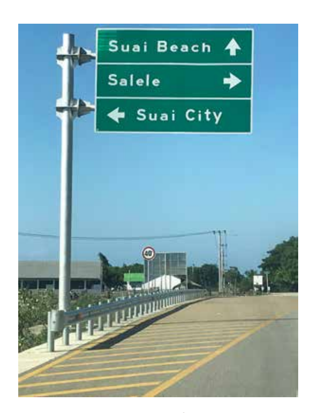
Signage on the open stretch of highway.

last 12 months. It has been announced that exploration will commence in the coming year however there is a lack of information on where this will occur and the impact on communities. The Rede Covalima Network is also monitoring this closely