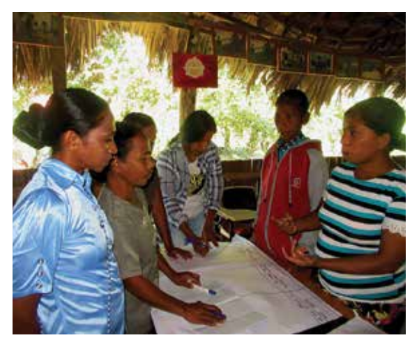
Women participating in a reflection workshop at the CCC.

speaking, conflict resolution and models of decision making. A further objective is to ensure that women understand gender equality and referral pathways for victims of family violence.