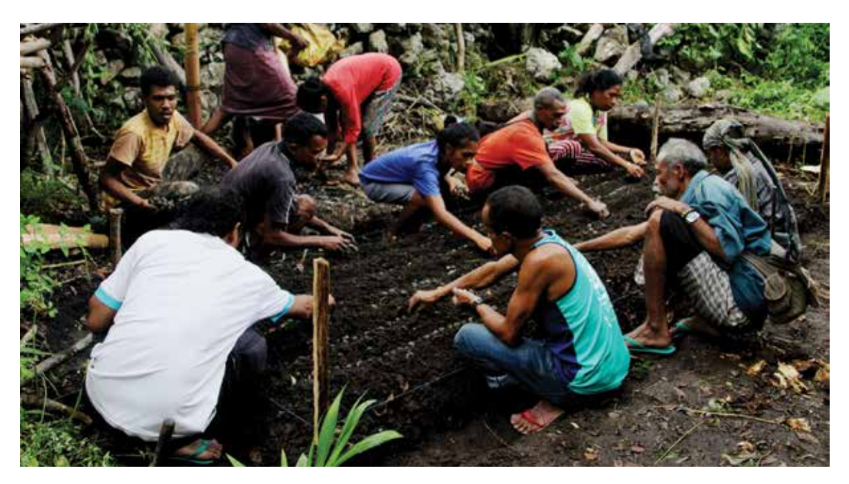
Working with rural famers groups to improve farming practices.

education and training in agroforestry and permaculture.