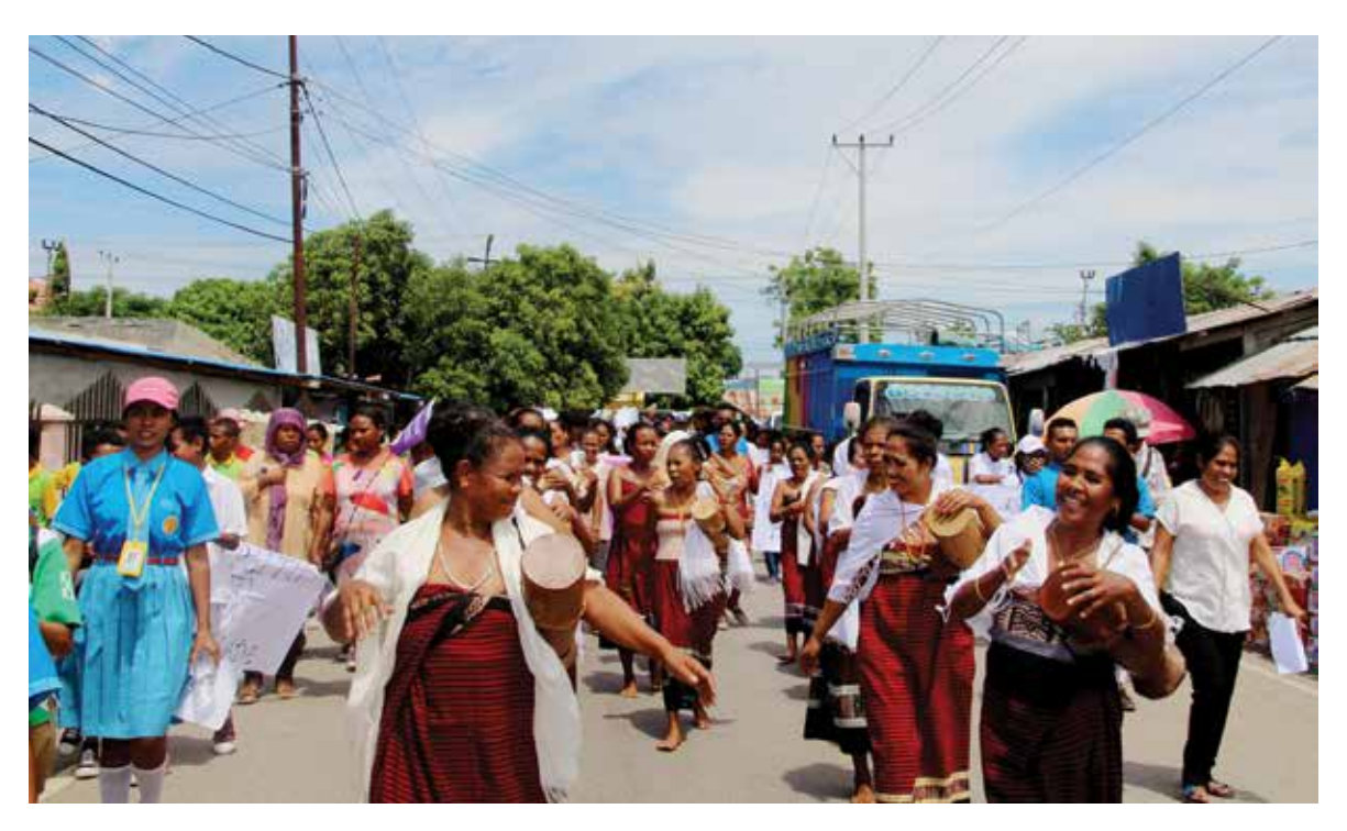
Women parading in the streets calling for equality.

(RHTO) to CCC staff. The training provided staff with a better understanding of how to work inclusively with people with disability, and to build disability awareness.