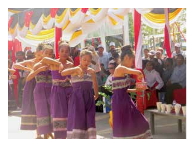
A traditional dance performance at the highway inauguration.