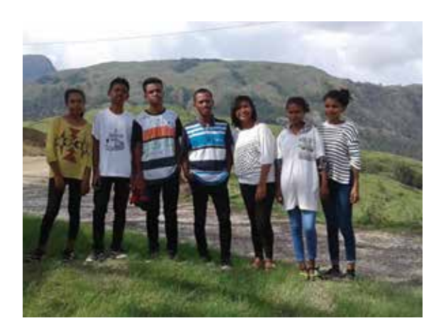
Students travelling to Maliana to sit entry tests.

Scholarships are funded through FoSC fundraising activities and community donations, and the application and