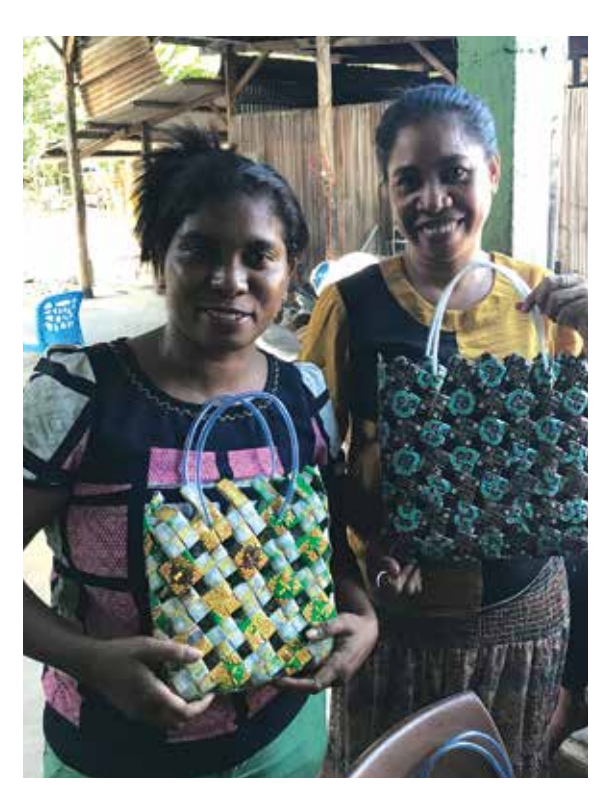
RWDP staff with bags produced by local women.

A key focus area for the CCC is to contribute to the empowerment of women; this includes support for economic activities and the encouragement of women's leadership and participation in political and civil life. It is recognised that the concept of gender equality challenges culture and tradition, and CCC staff are working hard to shift attitudes on the role