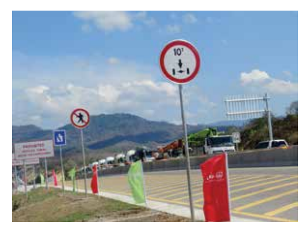
Section 1 of the new highway from Suai is now open.