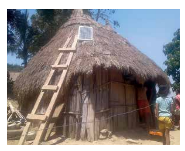
Solar installation in Halik Nai.

The CCC staff have played a key role in community consultation before and after