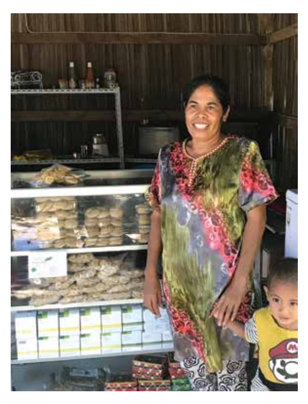
The Remajeleju group, established through the RWDP, have a very successful shop in Suai.

of women in leadership and the workplace, and the role of men in the home.