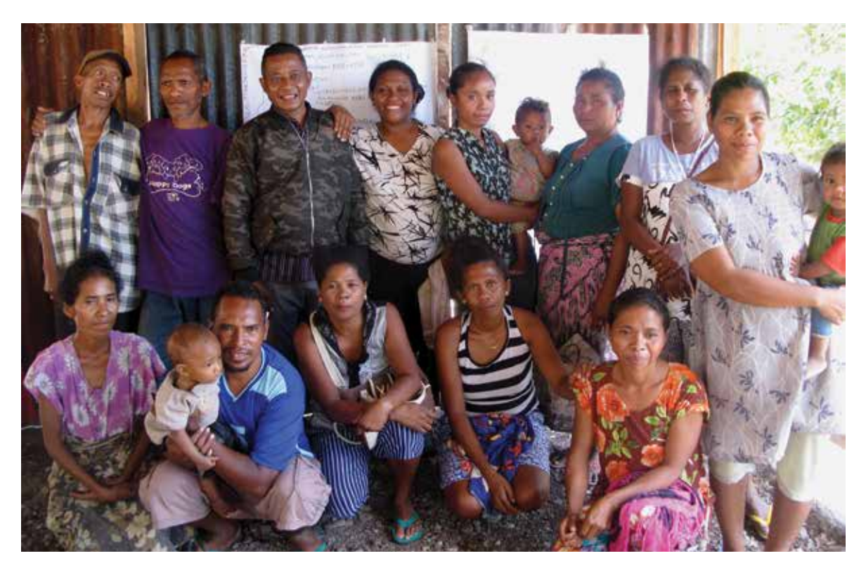
Communities receiving training for disaster risk reduction.

The network includes 12 member organisations, who meet quarterly and involve local government ministries and services in their meetings and training.