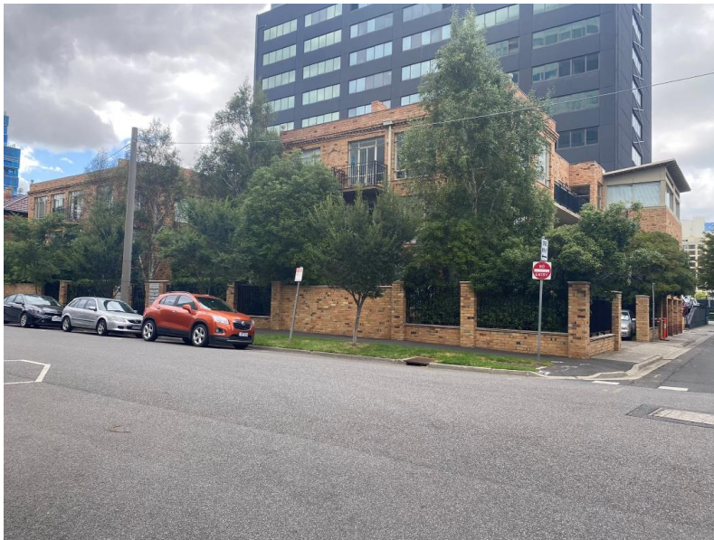
Photograph 1: Looking south-east along Louise Street to the subject site