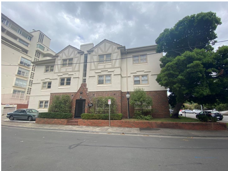
Photograph 7: 33 Queens Road when viewed from the eastern boundary of the subject site