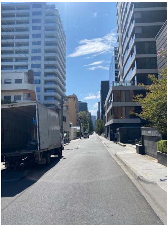
Photograph 15: Looking north along Queens Lane including to the rear of 478 St Kilda Road.