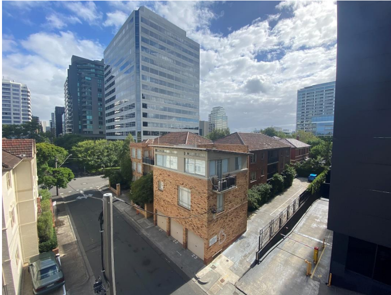
Photograph 10: View from 34 Queens Road looking towards the subject site with 492 St Kilda Road to the right of the photograph.