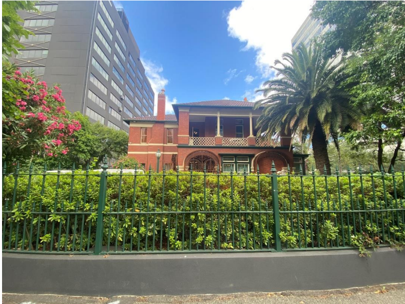
Photograph 4: 490 St Kilda Road with 492 St Kilda Road to the left of the picture