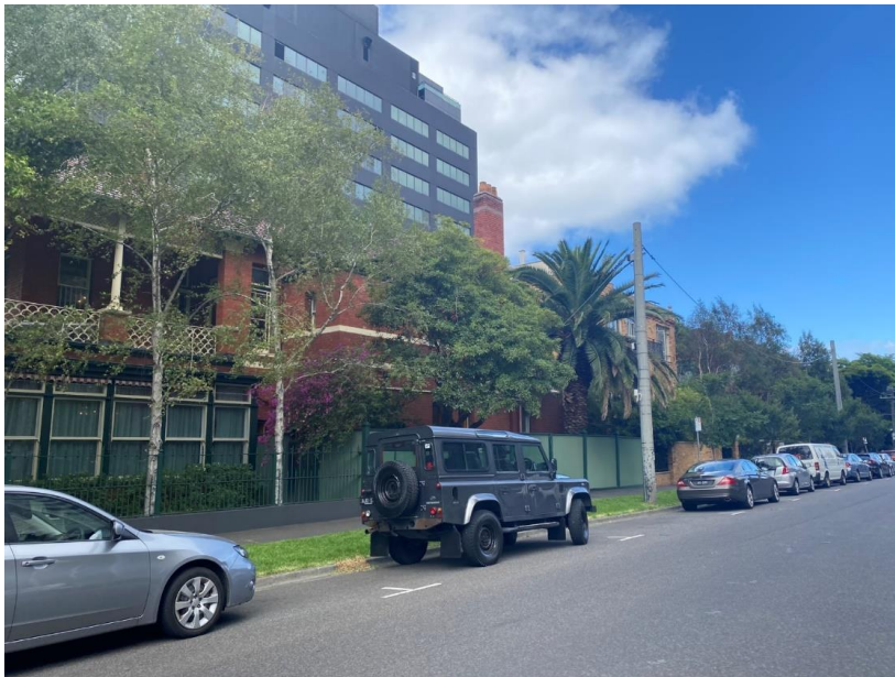
Photograph 2: Looking south along Louise Street to 490 St Kilda Road (foreground) and the subject site (background)