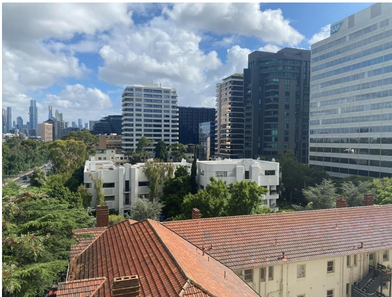
Photograph 11: View from 34 Queens Road looking north towards the tower developments between Queens Lane and St Kilda Road.