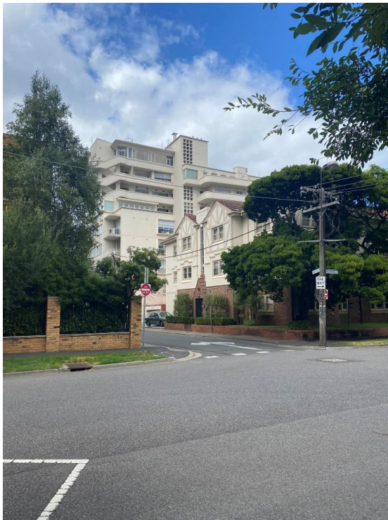
Photograph 6: Looking south-west from Louise Street to 33 Queens Road and 34 Queens Road in the background