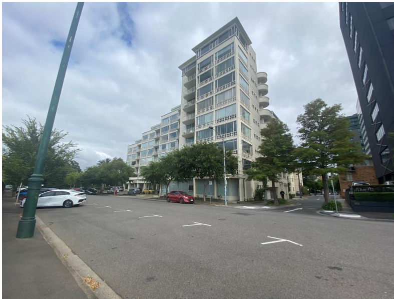
Photograph 12: Looking north-west from Hanna Street towards 34 Queens Road and 492 St Kilda Road (foreground). The subject site is in the background.