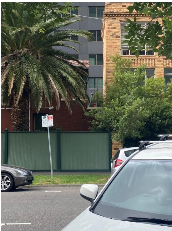
Photograph 3: Boundary between 490 St Kilda Road and subject site. 492 St Kilda Road in the background