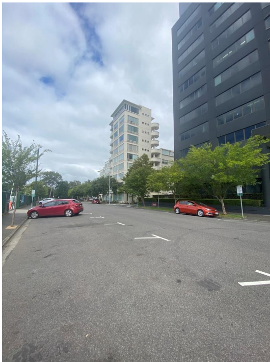
Photograph 13: Looking north-west from Hanna Street towards 34 Queens Road and 492 St Kilda Road (foreground).