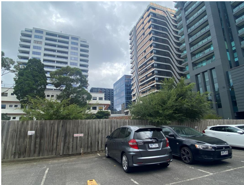
Photograph 14: Looking north from 32 Queens Lane towards tower developments along St Kilda Road.