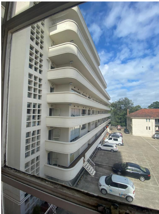
Photograph 9: View from 34 Queens Road looking towards open access corridors and car parking area.