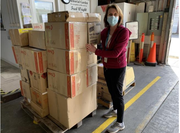
A CoPP community bus delivering the boxes to Rotary DIK, FoSC Coordinator organises the packaging and delivery