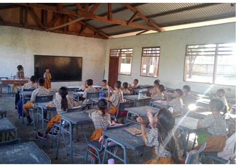
Left: One student is training to be a motorbike mechanic at Senai Becora and gaining lots of practical experience; Right: A student at Baucau Teachers College is completing her final three month placement at Debos Primary school in Suai