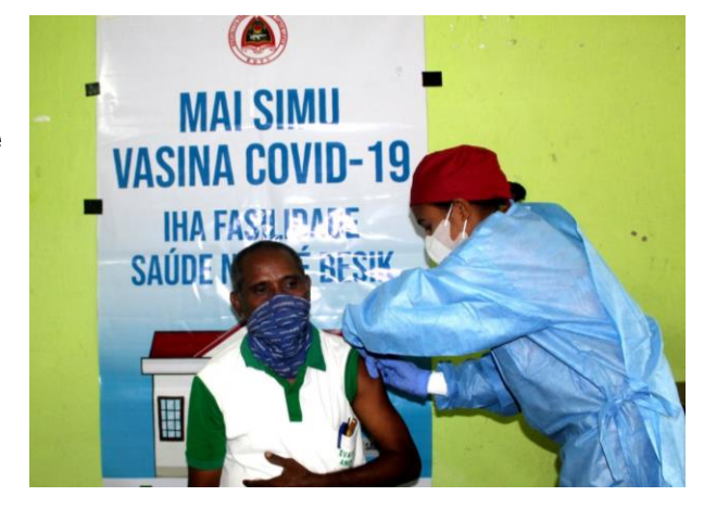
Staff received vaccines at a clinic set up at the CCC in August 2021

The CCC training room was used as a vaccination clinic on multiple occasions and the CCC vehicle was used to provide transport for community members who needed support to reach health clinics.