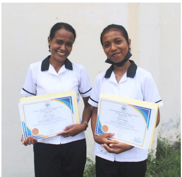
Left: Four students graduating from Baucau Teachers College; Right: Graduates from CVTC Suai graduated in December 2021 with a Certificate 2 in Hospitality