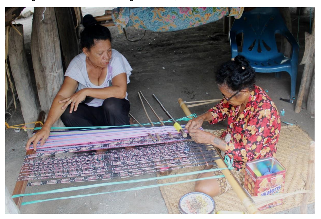
A member of the Fitun Naroman (Bright Star) group weaving a traditional tais

The CCC is nationally renowned for their work to support women's leadership, gender equality and raise awareness about gender based violence. They are actively involved in many networks and meetings with local and national government, NGOs and CSOs.