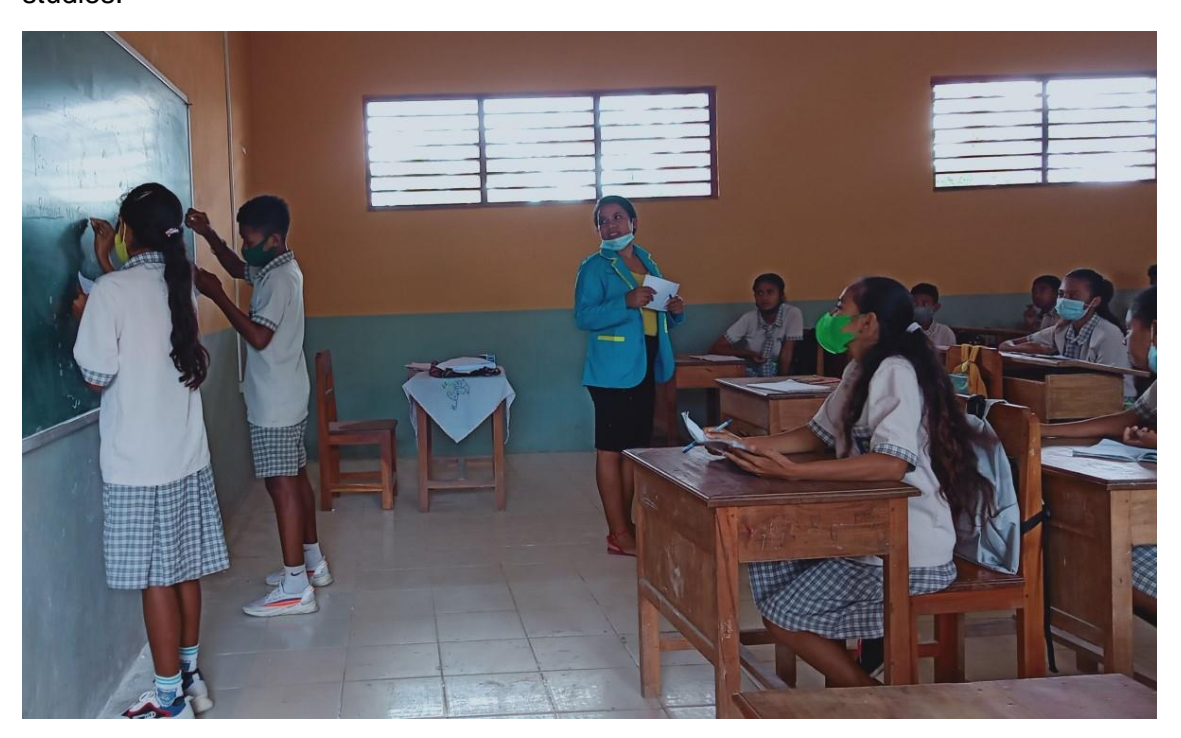
Students at Baucau Teachers College do a three month practical placement in their final year

Scholarships are funded through FoSC fundraising activities and community donations, and the Education Program Coordinator at the CCC organises the registration and enrolment processes and provides pastoral care. The Program Coordinator remains in contact with all students and training institutes, to ensure the welfare of students and provide encouragement throughout their studies.