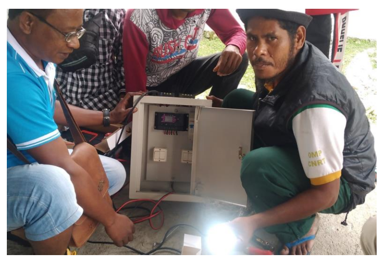
The CCC team installed solar lighting in sacred houses as part of a UNDP funded project

Using their excellent technical and communication skills, the project has involved a lot of community engagement, training and ongoing mentoring for local technicians. The installation was completed and officially launched in June 2022. The Municipal Administrator attended the launch and communities are thrilled with the results.