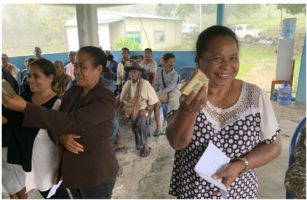
Annual payments were made to landholders at an official ceremony in Lalawa in June 2022.