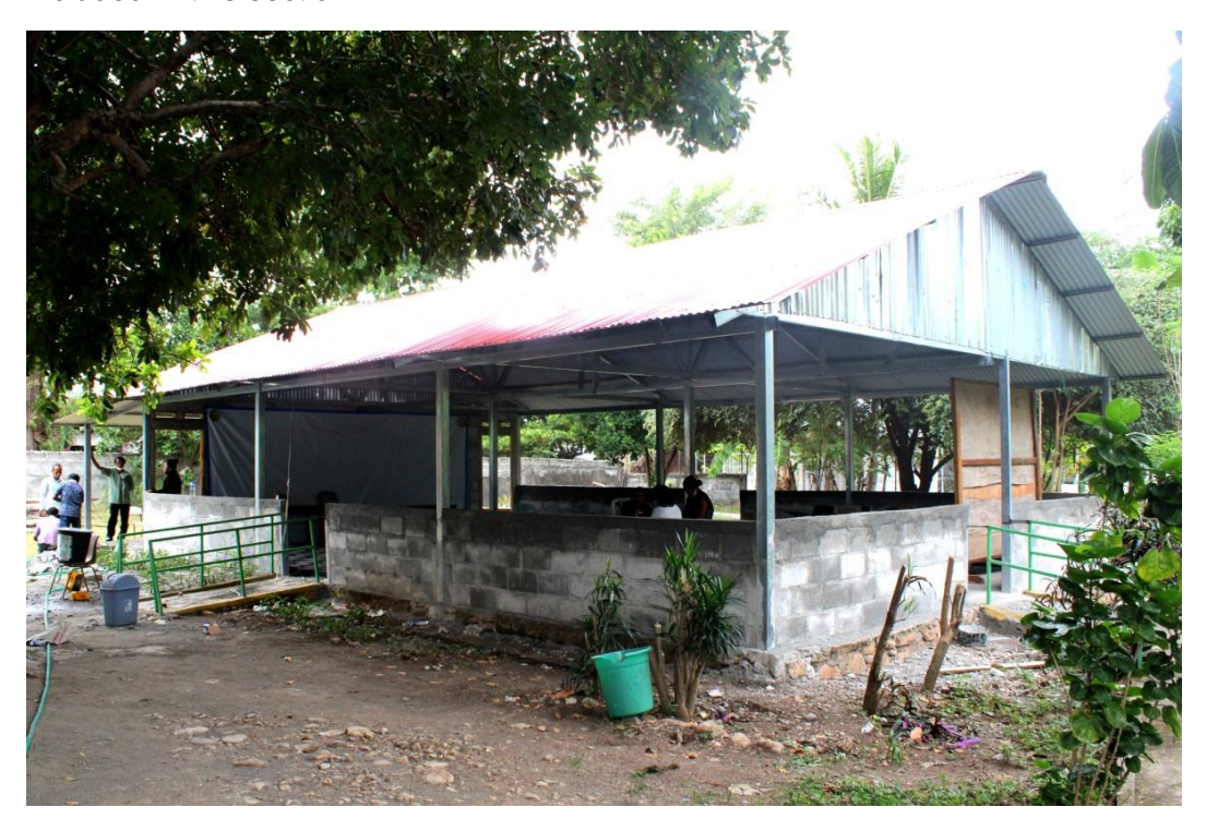
The CCC training room was rebuilt due to flood damage and is now hired regularly by community groups.

An outline of the programs implemented at the CCC this year, and their funding partners, is included in this section.