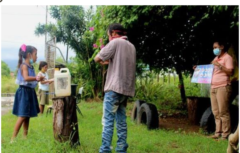
Students at CCC learning about the importance of handwashing training

Costs for the training are minimal and are funded through the Civic Health Fund established with funds by FoSC since June 2020.