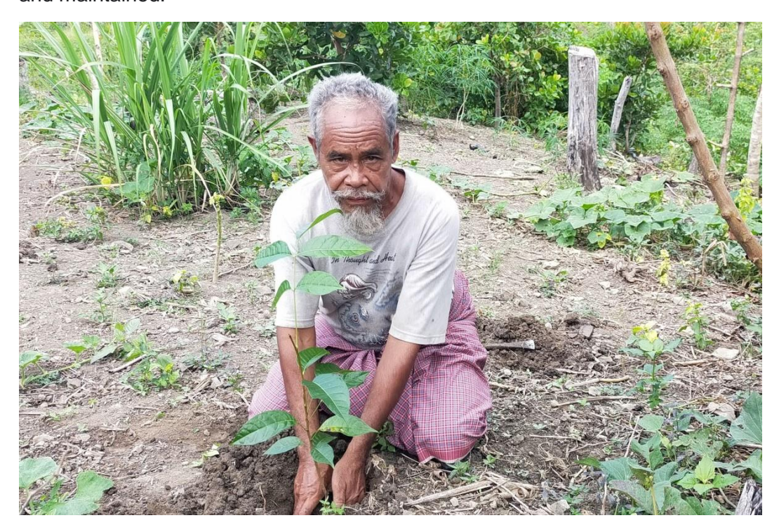
Mahogany seedlings are distributed and planted each year by local landholders.

Data on tree location and ownership is captured using TreeO2 technology. This digital community forestry management platform is specifically designed to manage smallholder tree and carbon farming. A website is being developed so that donors can see where the trees are being planted and maintained.