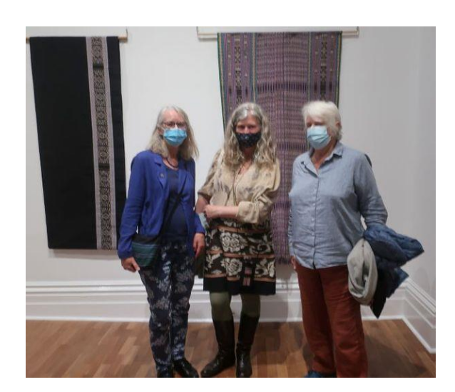
Many FoSC supporters and Port Phillip residents and artists enjoyed the exhibition