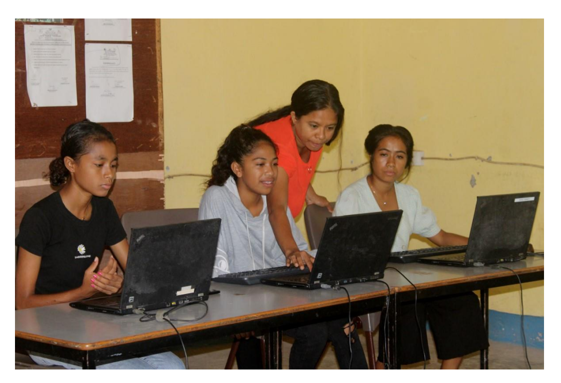
CoPP superseded laptops are used to deliver community training at the CCC

Access to computers and training ensures community members can develop skills for employment and education purposes and improved access to information.