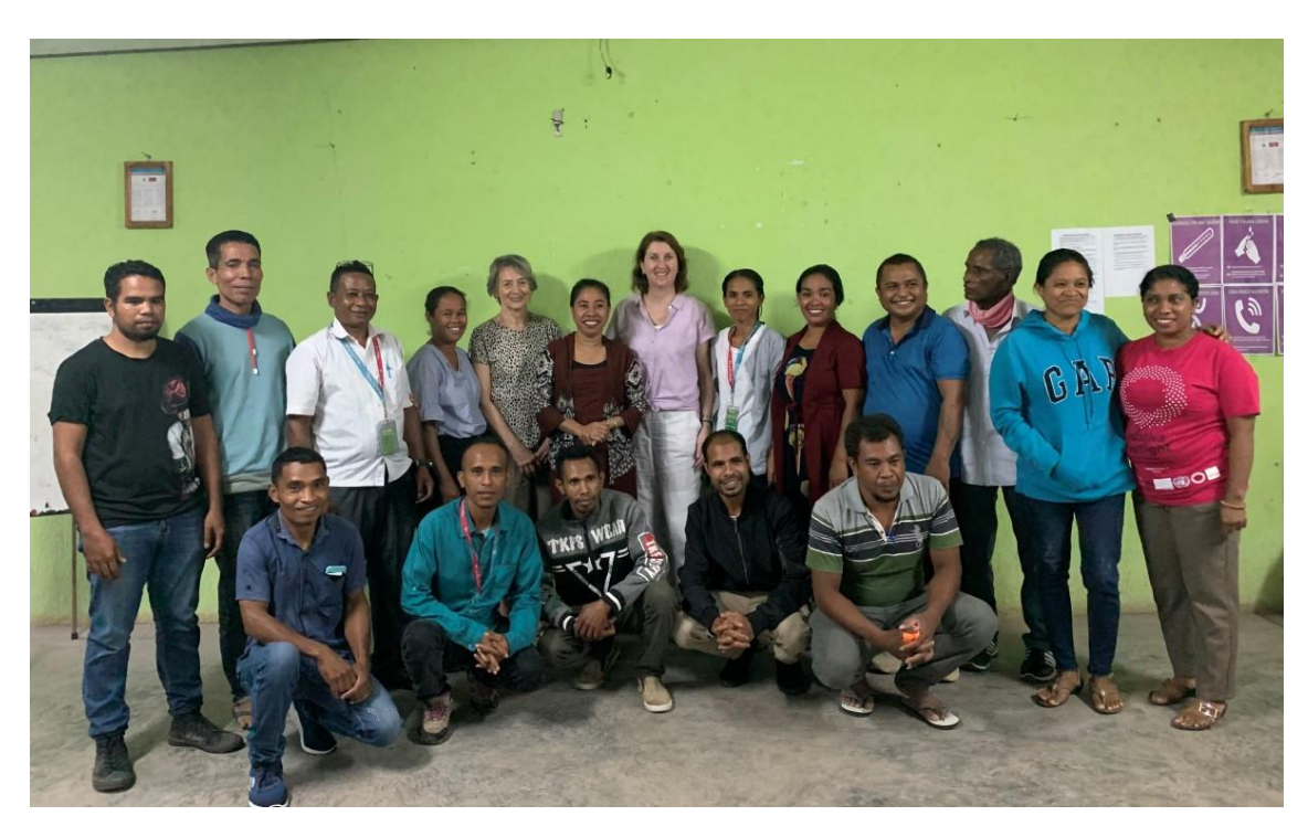
CCC Commission and staff meeting on 30 June

A meeting was held with the CCC Commission and staff to clearly outline the changes to funding arrangements over the next four years, including the reduced role of the FoSC Coordinator.