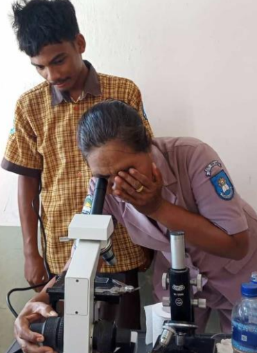
Students and teachers regularly borrow the books and science equipment at the Suai Secondary school library