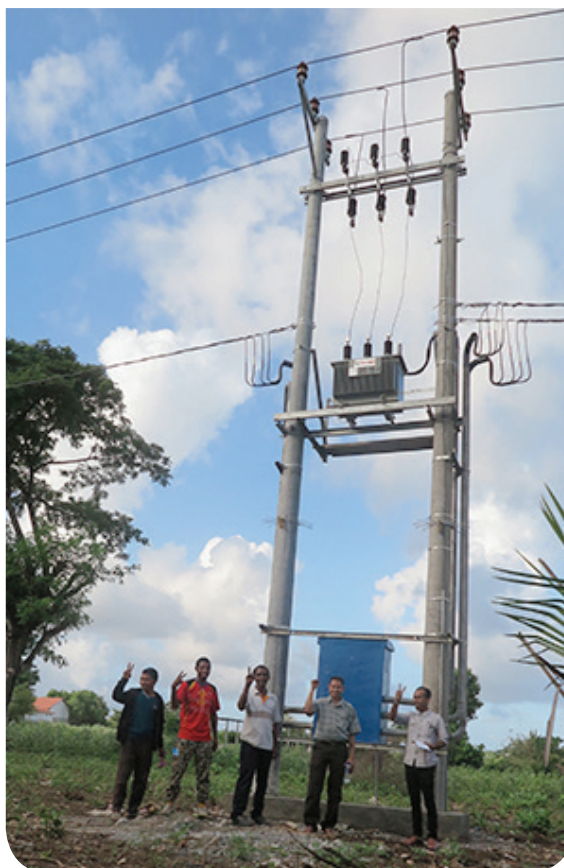
The CCC staff, the school community and local MP successfully lobbied the government for the upgrade of power to the school.

This project has been the most ambitious joint undertaking of FoS/C and CCC, and both partners have learned much along the way. A major public health issue facing the district is that few schools have a reliable water supply, or toilets for children and teachers to use. The construction of a new toilet block and renovation of existing but unusable toilets was