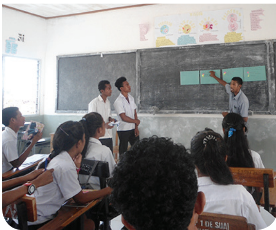
CCC and student trainers hold a workshop making the connection between hygiene and good health.

completed this year, a water tank and septic tank were installed and water was connected to all facilities. 6 new toilets were constructed with disability access, 12 existing toilets renovated and hand basins installed in all the toilet blocks. The introduction of health and hygiene training for the school community was part of the final phase of the project.