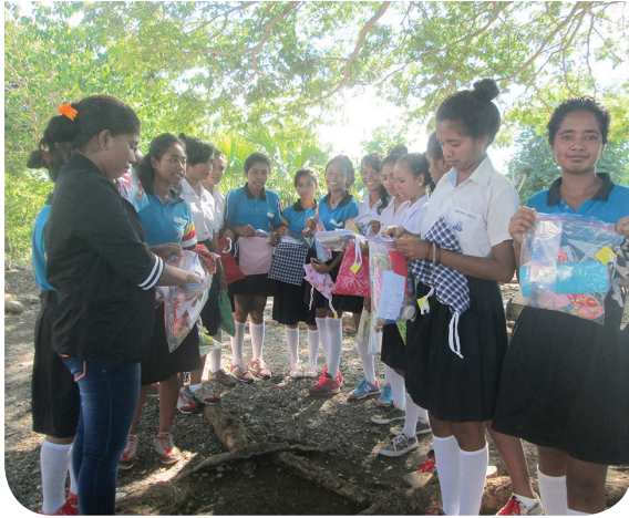
The hygiene packs with reusable sanitary pads donated to girl students by Days for Girls, Brighton.