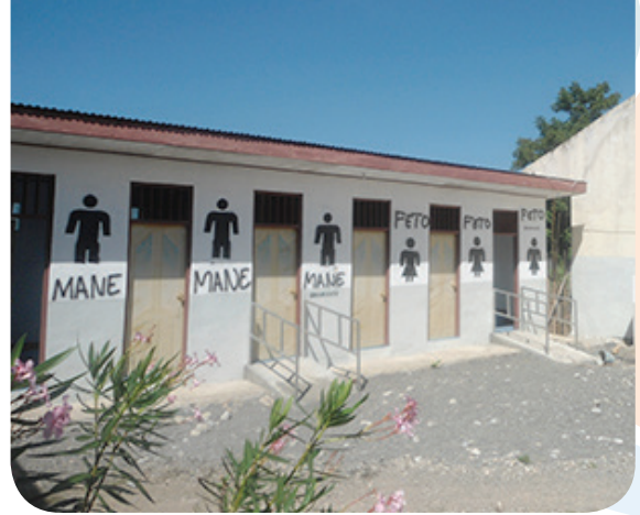
A major aim of the WASH project is to improve girls' attendance at school.