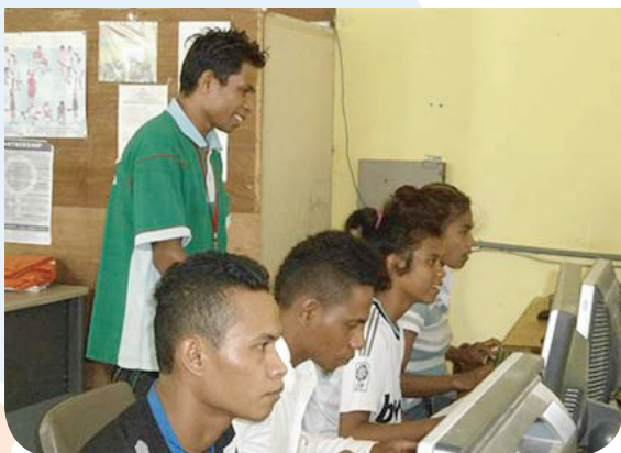
Students taking IT and English training at CCC.

During the year, the CCC IT social enterprise enrolled 411 trainees (208 female and 203 male) with 198 (100 female and 98 male) successfully completing and being awarded certificates. The students combined IT training with English Language for six months. IT training was provided also to National Police of Timor-Leste (PNTL) with certificates awarded to 55, 17 female and 48 male.