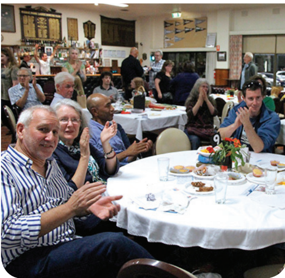
FoS/C Trivia night was great fun and attracted 130 guests raising $9,000 with two bands, the Geezers and Timor Students Band performing.

Quarterly newsletters and articles in Diversity , the City of Port Phillip newsletter were produced which continue to highlight the work and provide information to the community about activities here and in Timor Leste. Donations from committed donors have totalled some $50,000 this year, which extends the effectiveness of FoS/C programs and projects, in particular for the scholarships program which would not be possible without this support. Funds were also raised through a film night and a successful Trivia Night held at the Middle Park Bowls Club in April 2016. As well as raising funds, the trivia night was a very enjoyable evening attended by around 130 people.