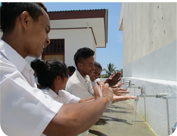
Washing hands with soap and water in the new hand-basins.

This project has brought water and sanitation to the school students who this year total 1,542 (822 girls and 680 boys) as well as approximately 70 teachers at the school. The water supply will also benefit a nearby community who use the community water tank.