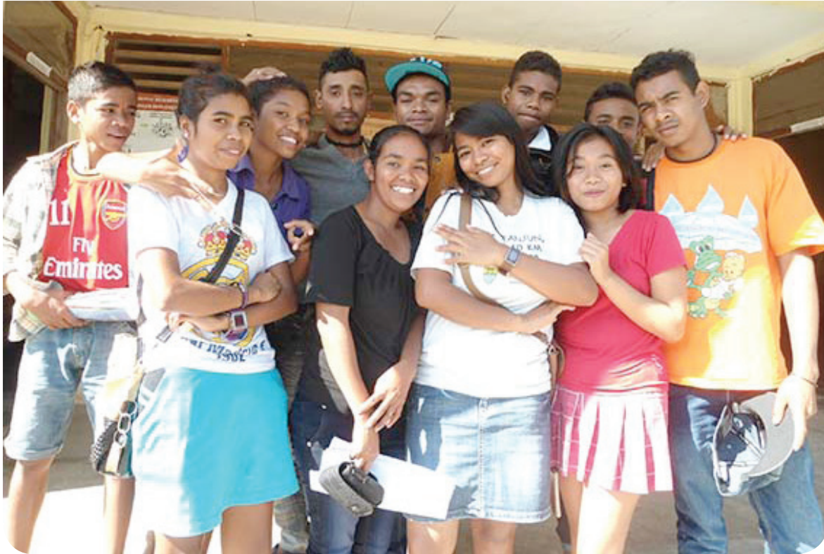
English language students at CCC.