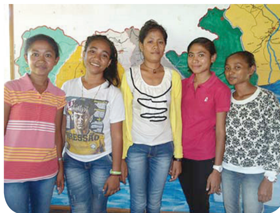
All five girls from rural villages in Covalima have settled into their Nursing/Midwifery Bachelor Degree at UNTL, Dili.

student studying primary teaching at Baucau. In addition, for the first time 5 female students gained entry to the nursing course at Timor-Leste National University in Dili. 2 students awarded scholarships previously are continuing their primary teacher training at Baucau and are in their final year.