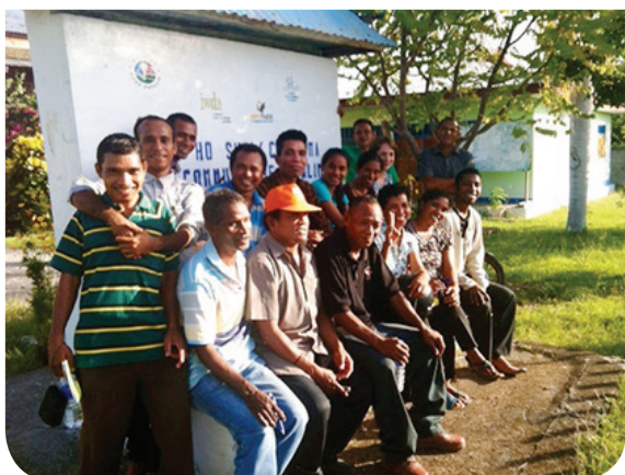
CCC Commission and staff following the workshop that drafted the new CCC Strategic Plan 2016-2020 .